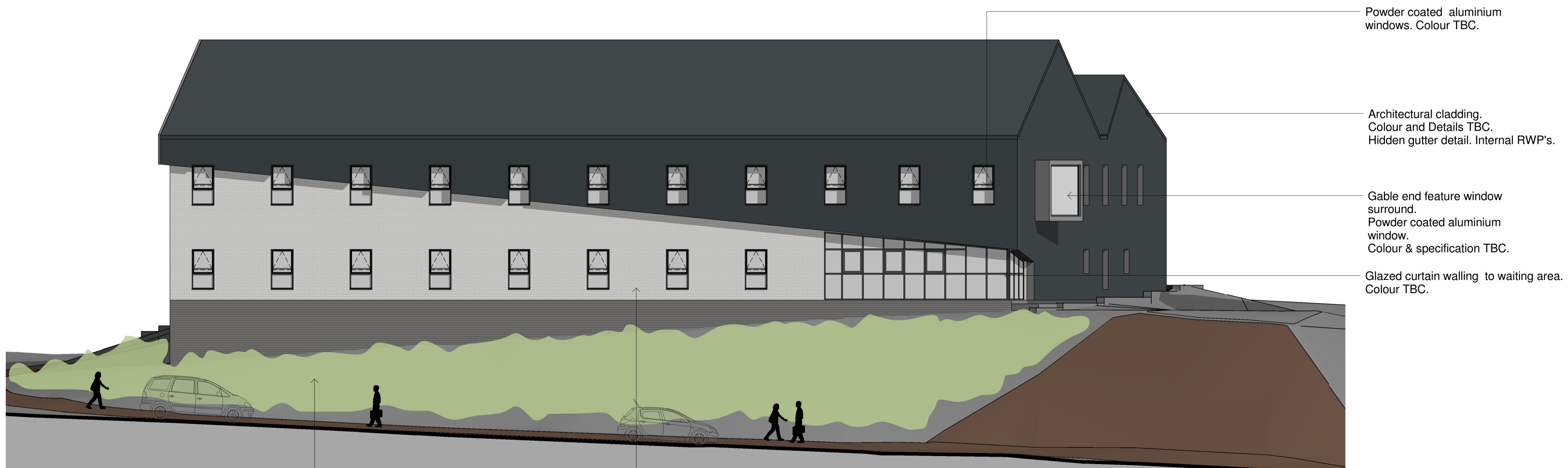
2 North East Elevation 1 : 100

Powder coated aluminium glazing & doors to main entrance. Colour TBC. Security Roller shutter to pharmacy