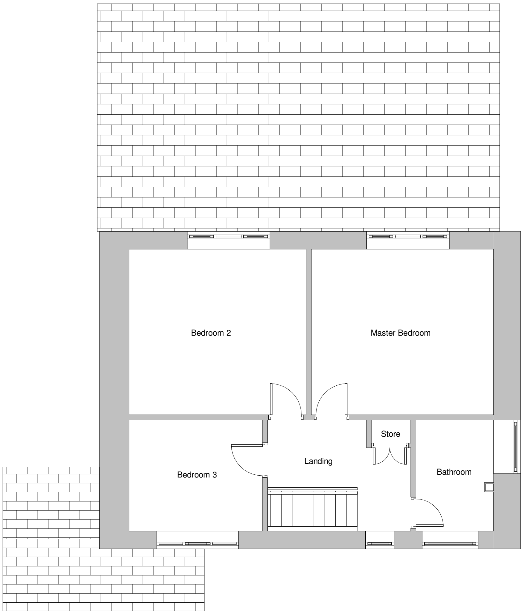
First Floor Level Scale: 1 : 50