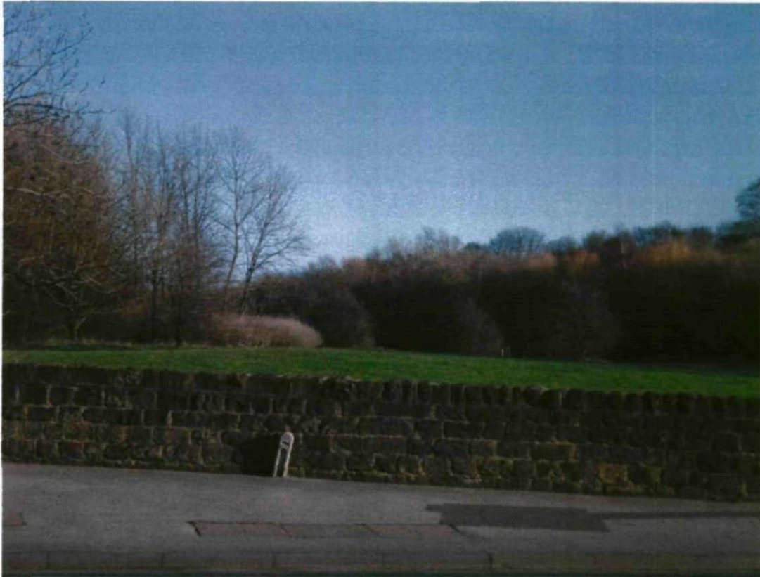
PHOTOGRAPH No.1: Site from A61 Sheffield Road