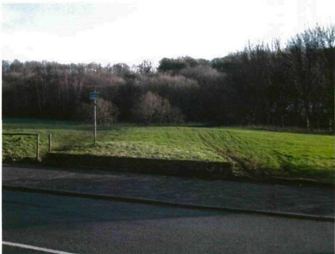
PHOTOGRAPH No.2: from B6100 West Street