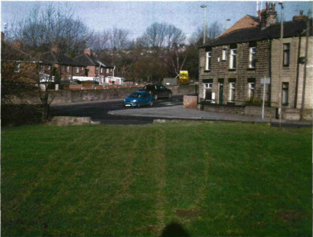
PHOTOGRAPH No.3: Site looking towards A61/B611 junction