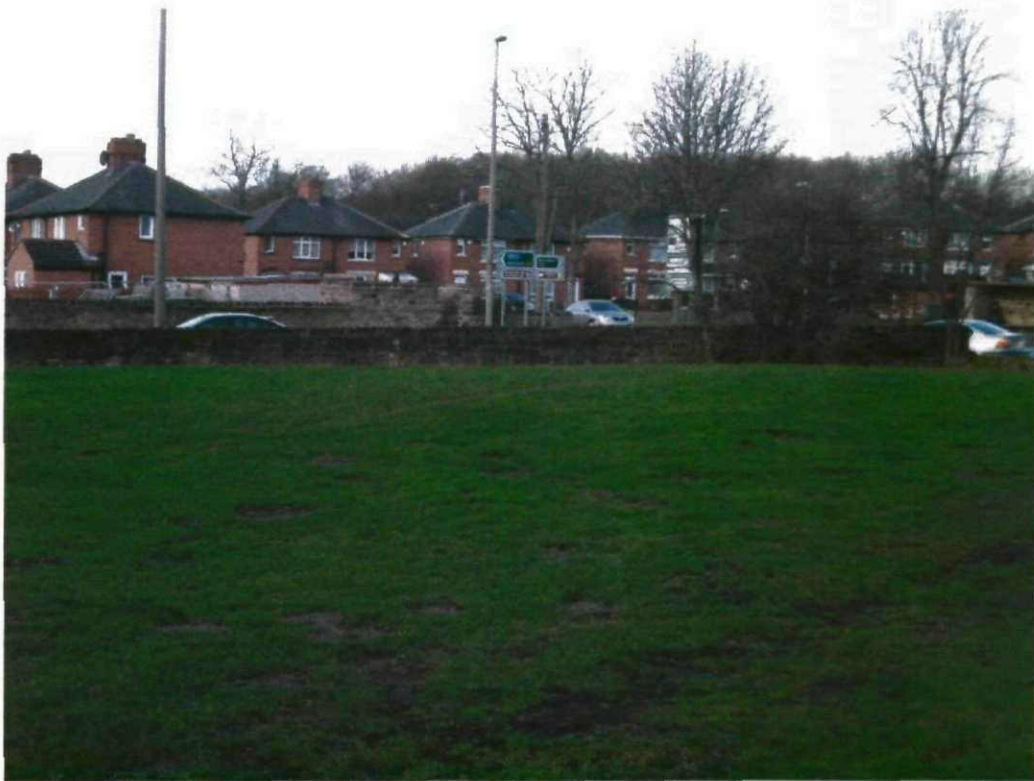
PHOTOGRAPH No.4: Site looking from Canal Basin