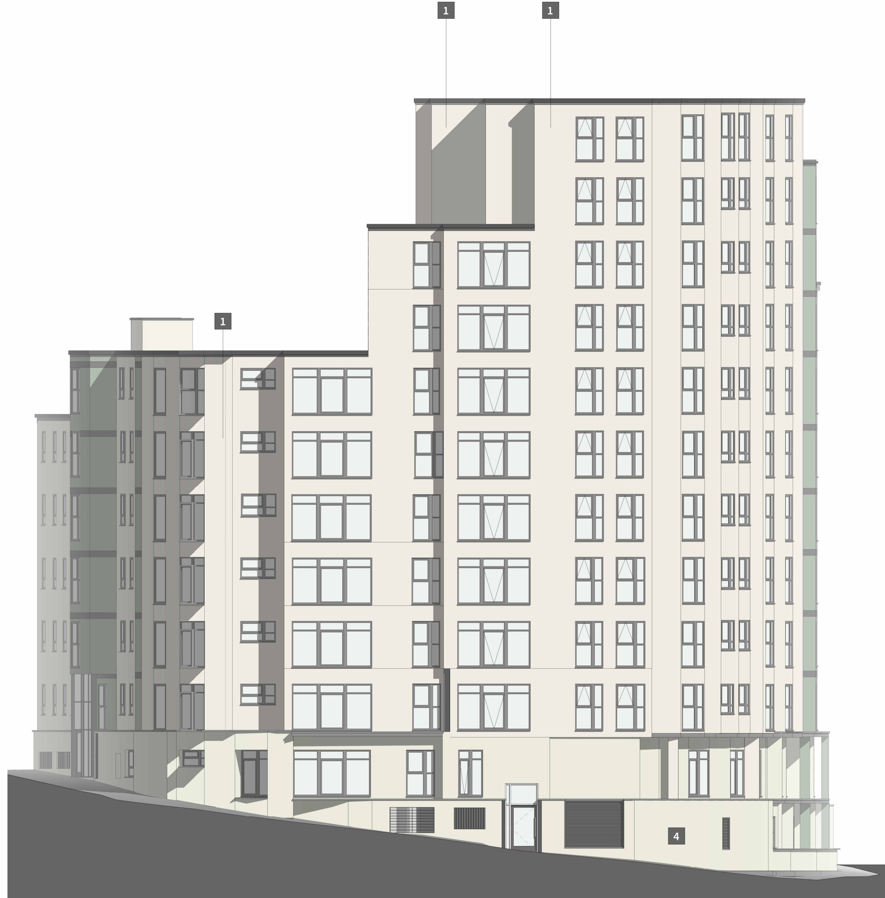
1 Existing_Elevation - Heelis street-01 1:100