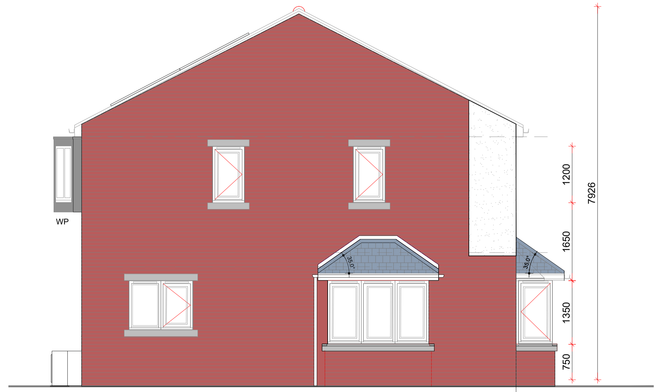
NORTH WEST FACING (SIDE) ELEVATION - PLOT 3