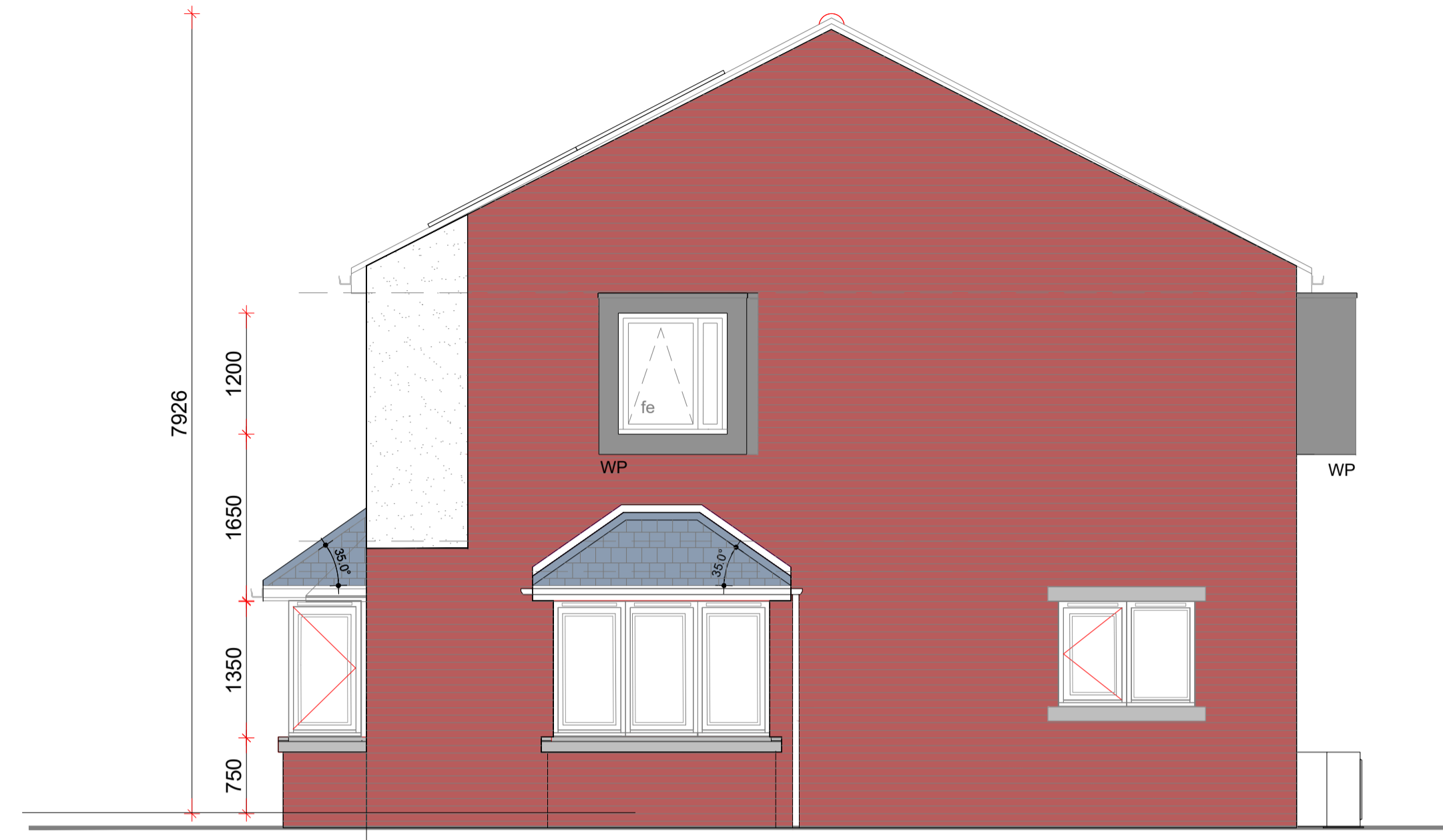
SOUTH EAST FACING (SIDE) ELEVATION - PLOT 4