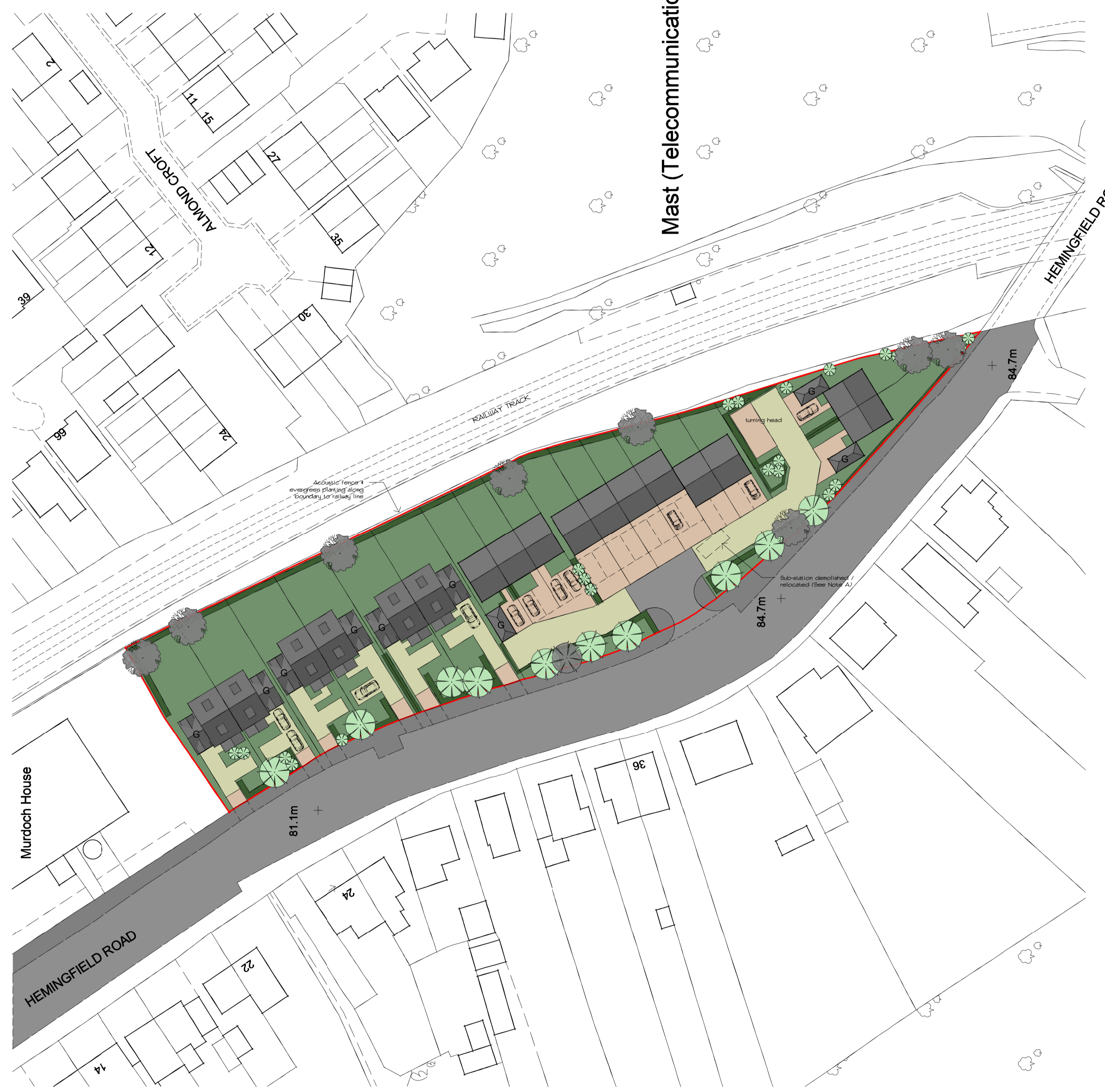
Site Plan 1 : 500