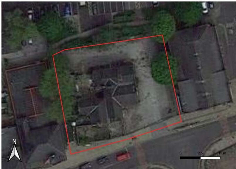
Figure 1 The Site boundary – all building within the red-line boundary were subject to survey