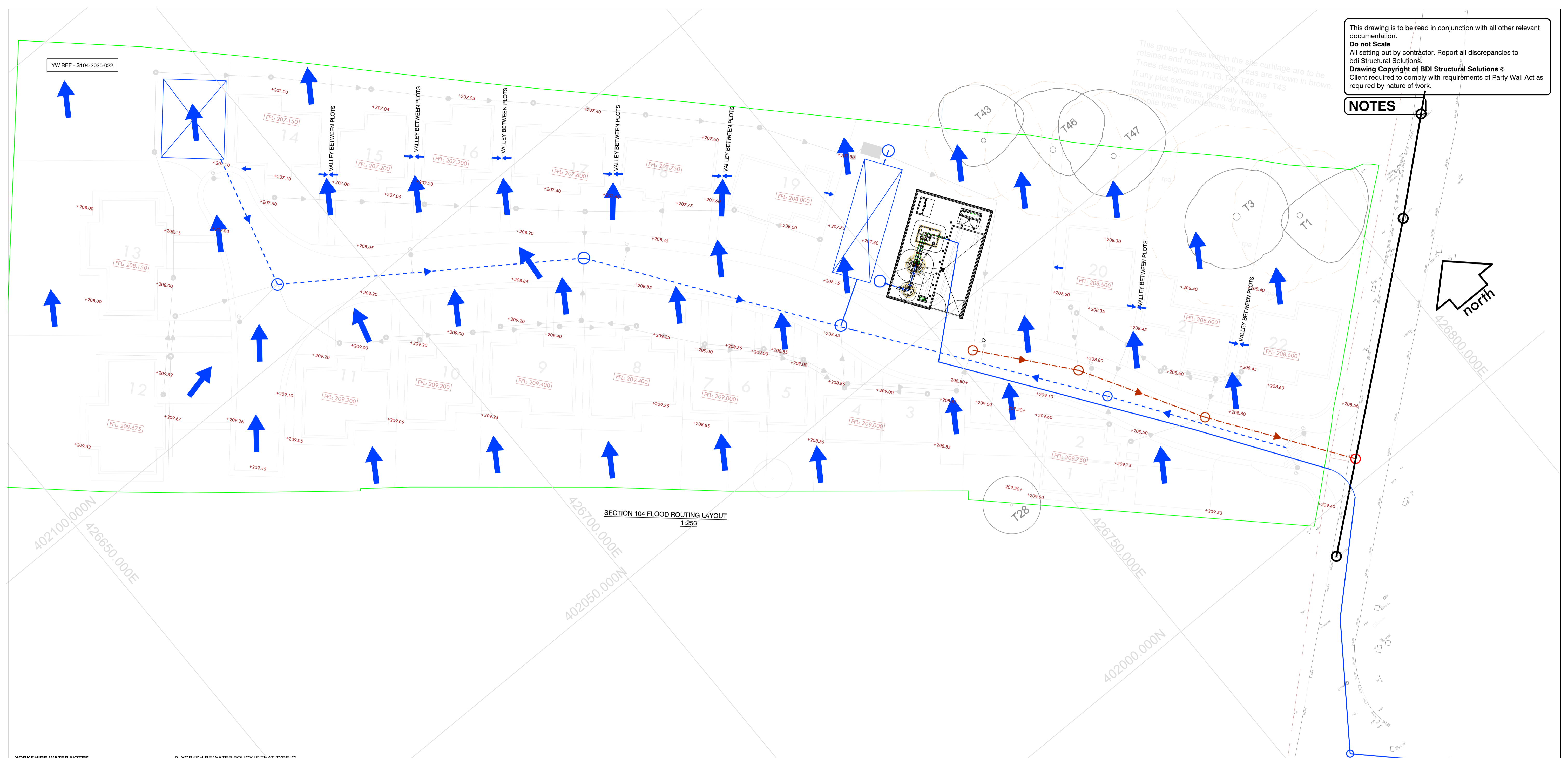
SECTION 104 FLOOD ROUTING LAYOUT 1:250

This group of trees within the site curtilage are to be retained and root protection areas are shown in brown. Trees designated T1, T3, T4, T6 and T43. If any plot extends marginally into the root protection area, this may require non-intrusive foundations, for example pile type.