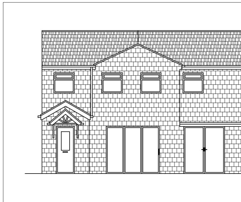
EXISTING REAR ELEVATION SCALE 1:100 AT A3