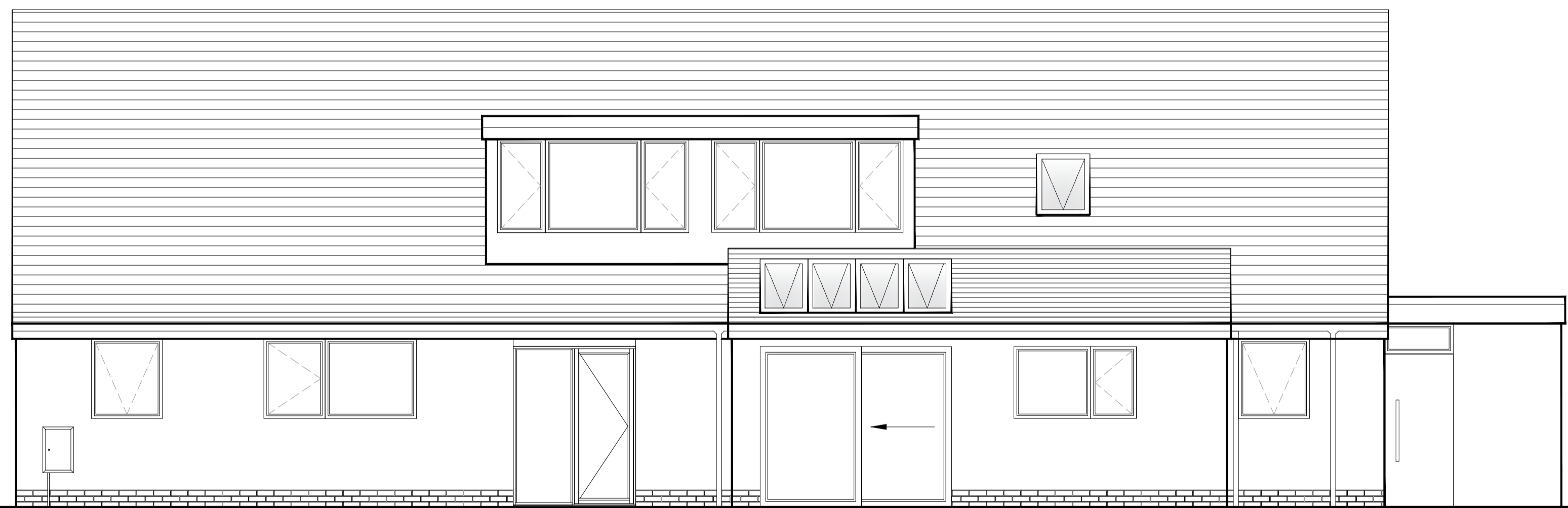
Existing North-Western Side Elevation Scale 1:50