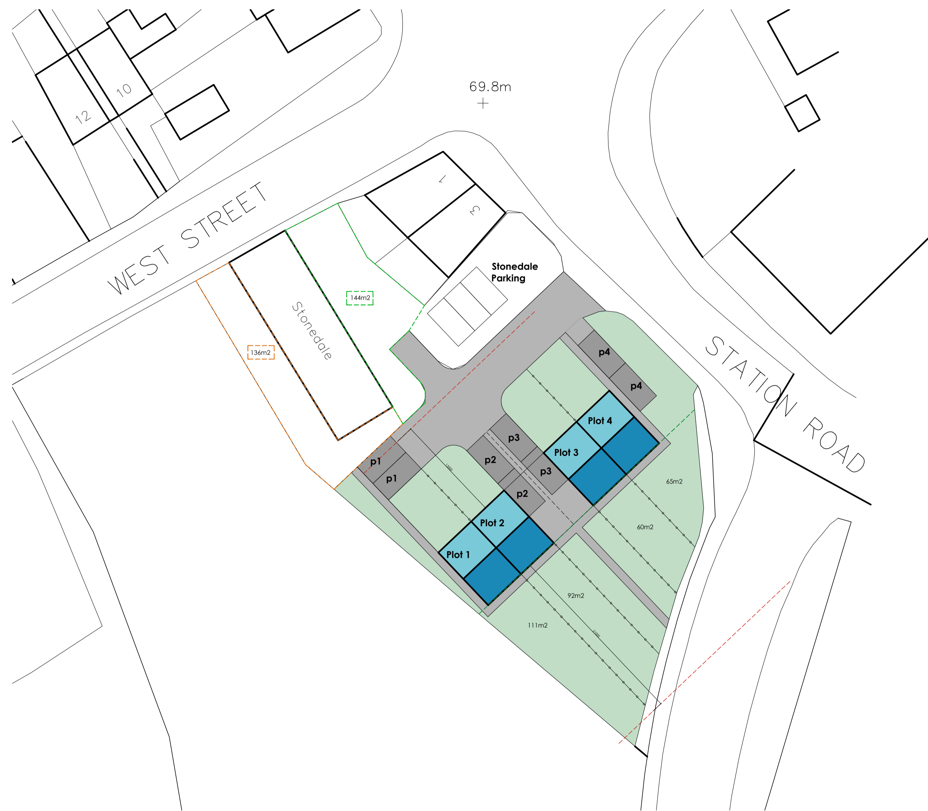
SITE PLAN SCALE 1:250