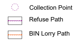
Refuse Plan - 1022 m 2 1:200 @ A3 0m 1m 2m 4m 6m 8m 10m