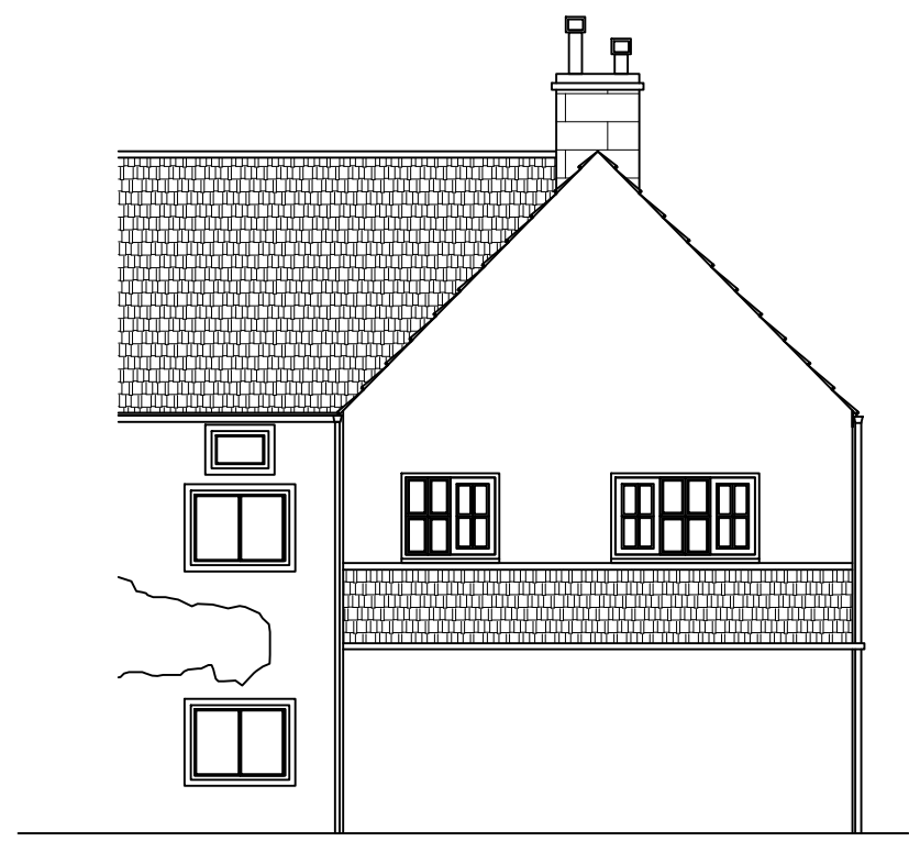
PROPOSED END ELEVATION SCALE 1:100 AT A3