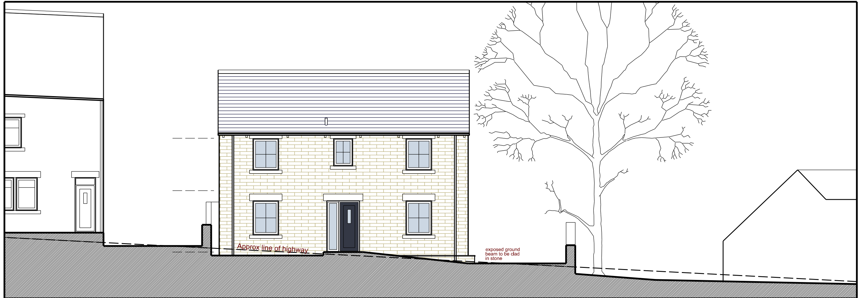
North Elevation - Proposed