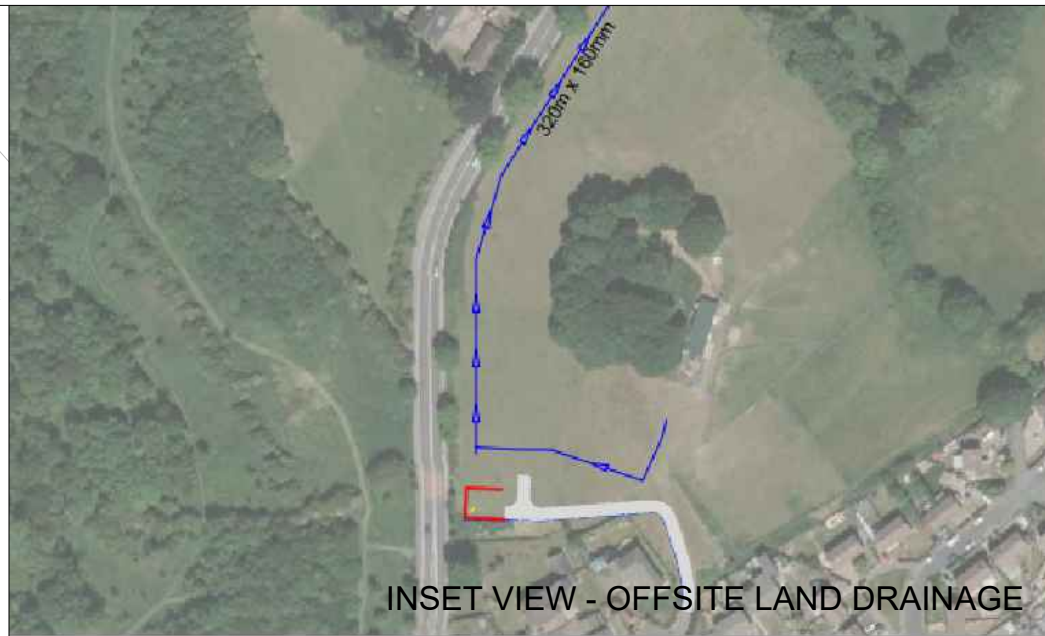
INSET VIEW - OFFSITE LAND DRAINAGE