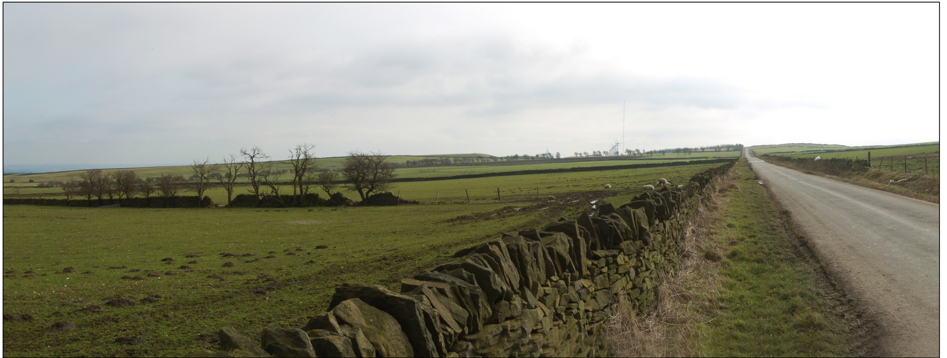
Existing view from viewpoint