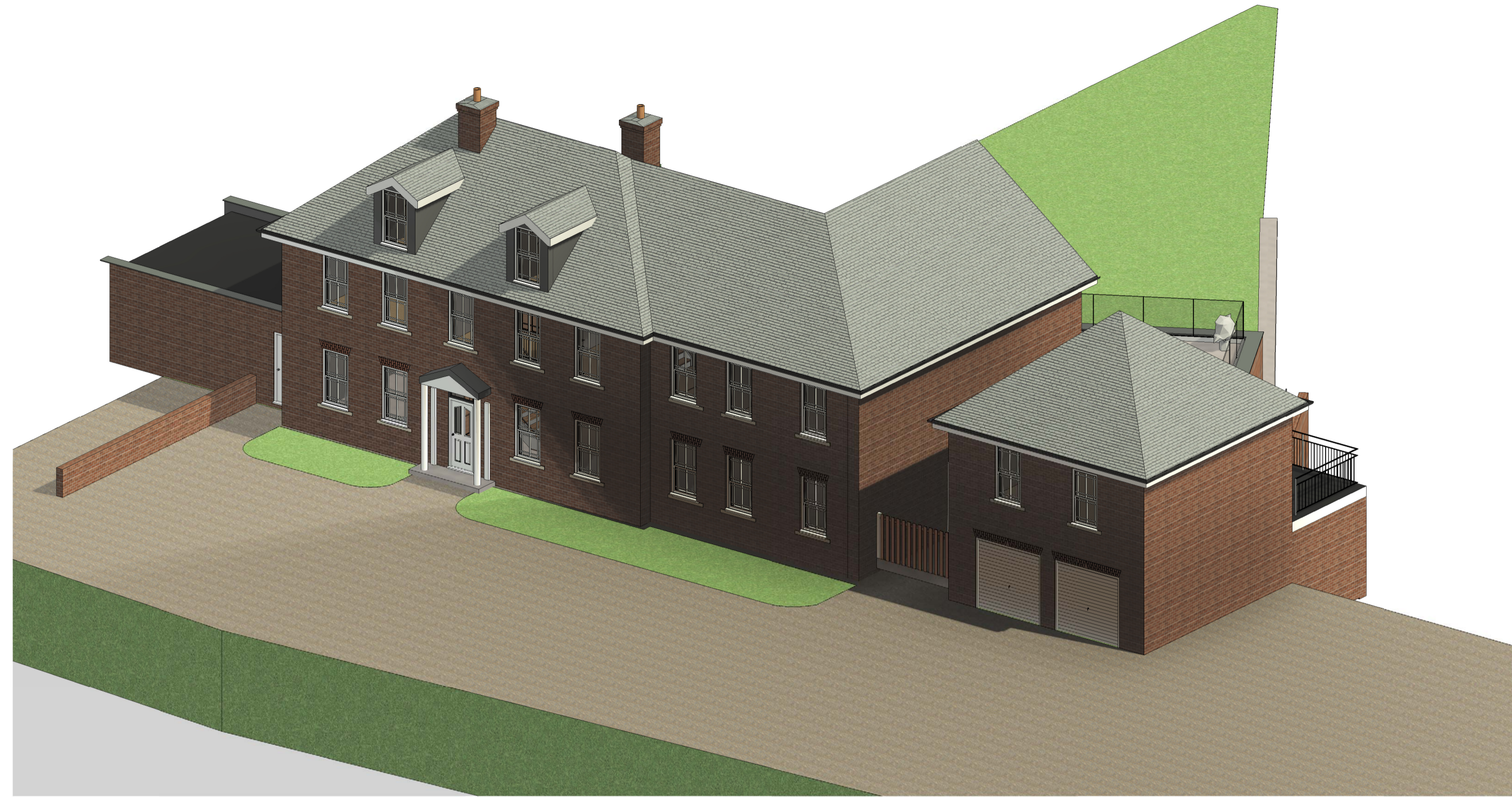
1 Principal Elevation

Do not scale from this drawing. The contractor is to check all dimensions on site and report any discrepancies to the designer. All rights described in chapter IV of the copyright, designs and patents act 1988 have been generally asserted. Notes