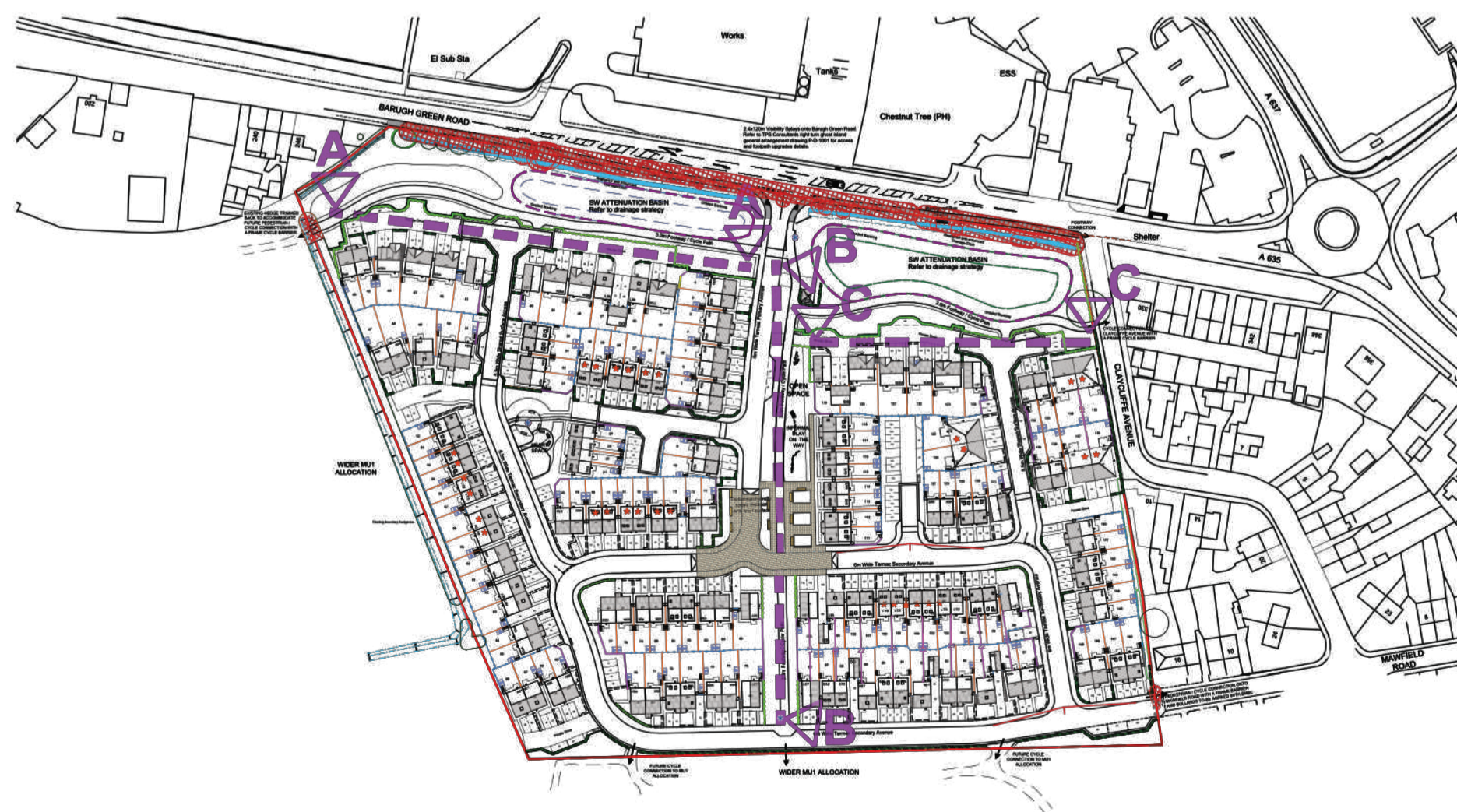
STREET SCENES KEY