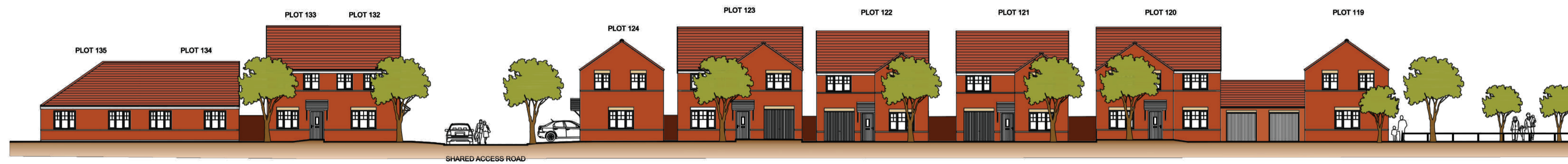
STREET SCENE C-C 1:200 - View Fronting Barugh Green Road - Open Space