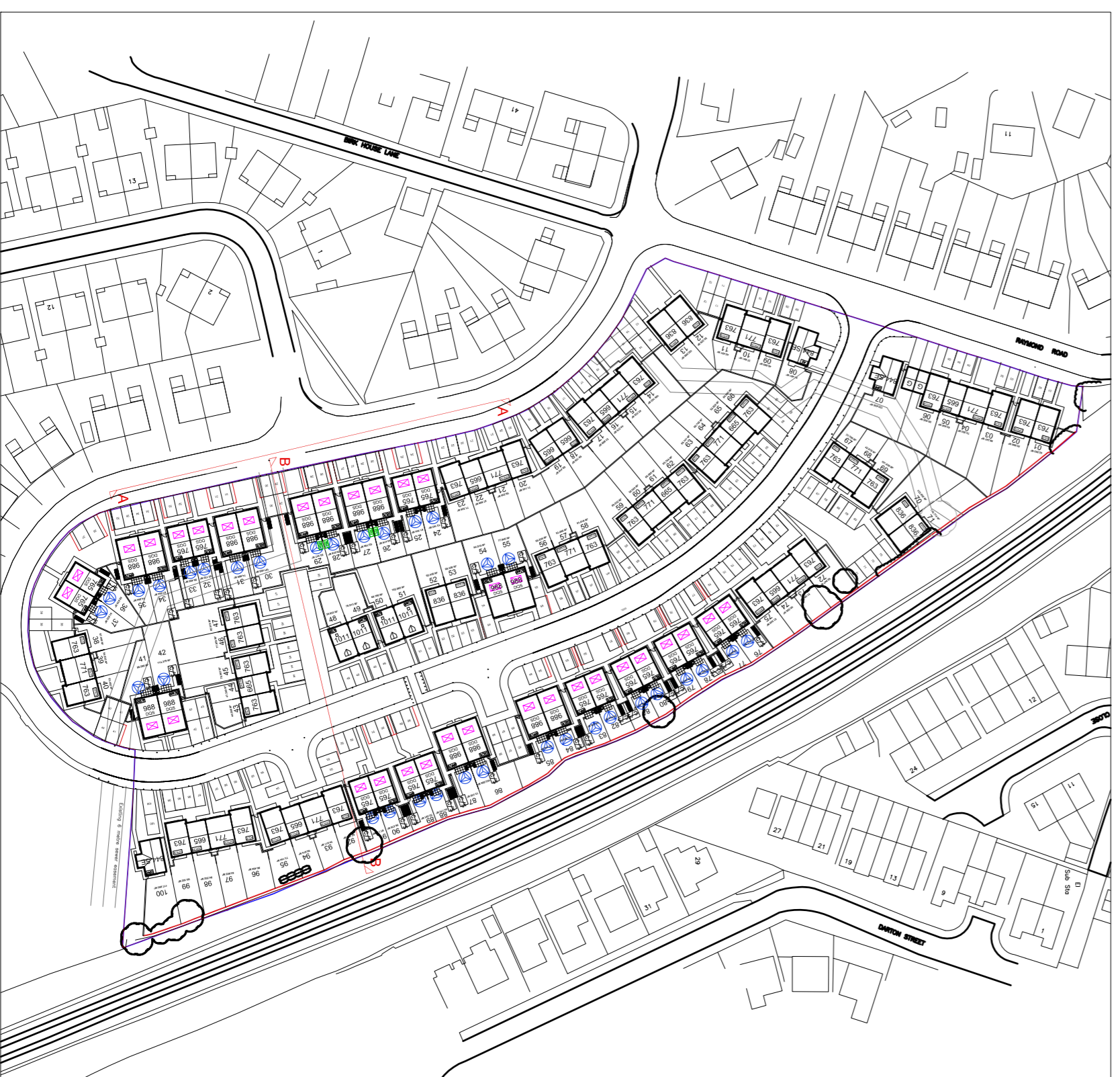
PROPOSED SITE PLAN SCALE 1:1250

Rev A, Acoustic fence height amended from 2.8m to 2.4m as per councils request, PDH 04 12 09