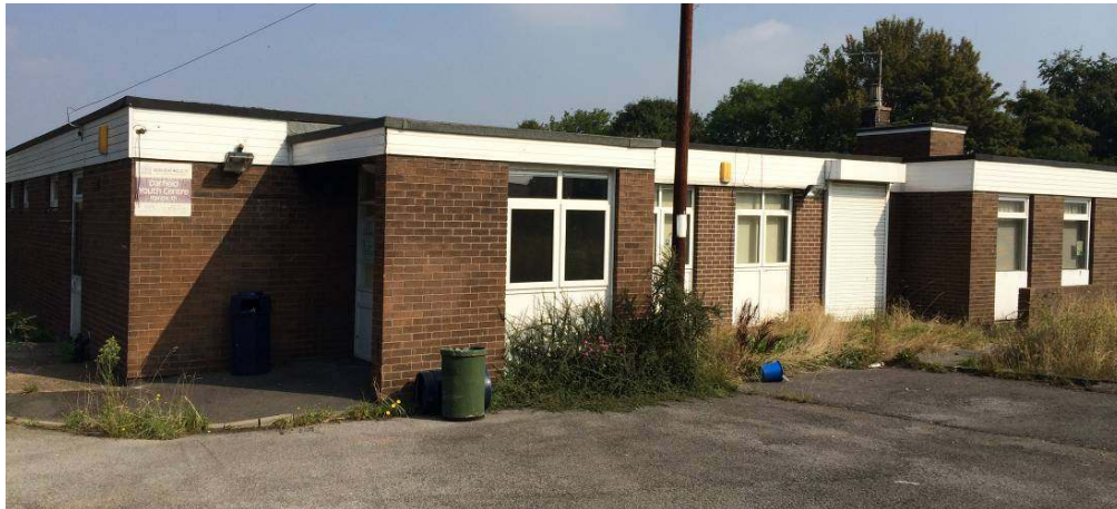
Figure 2 General view of the property