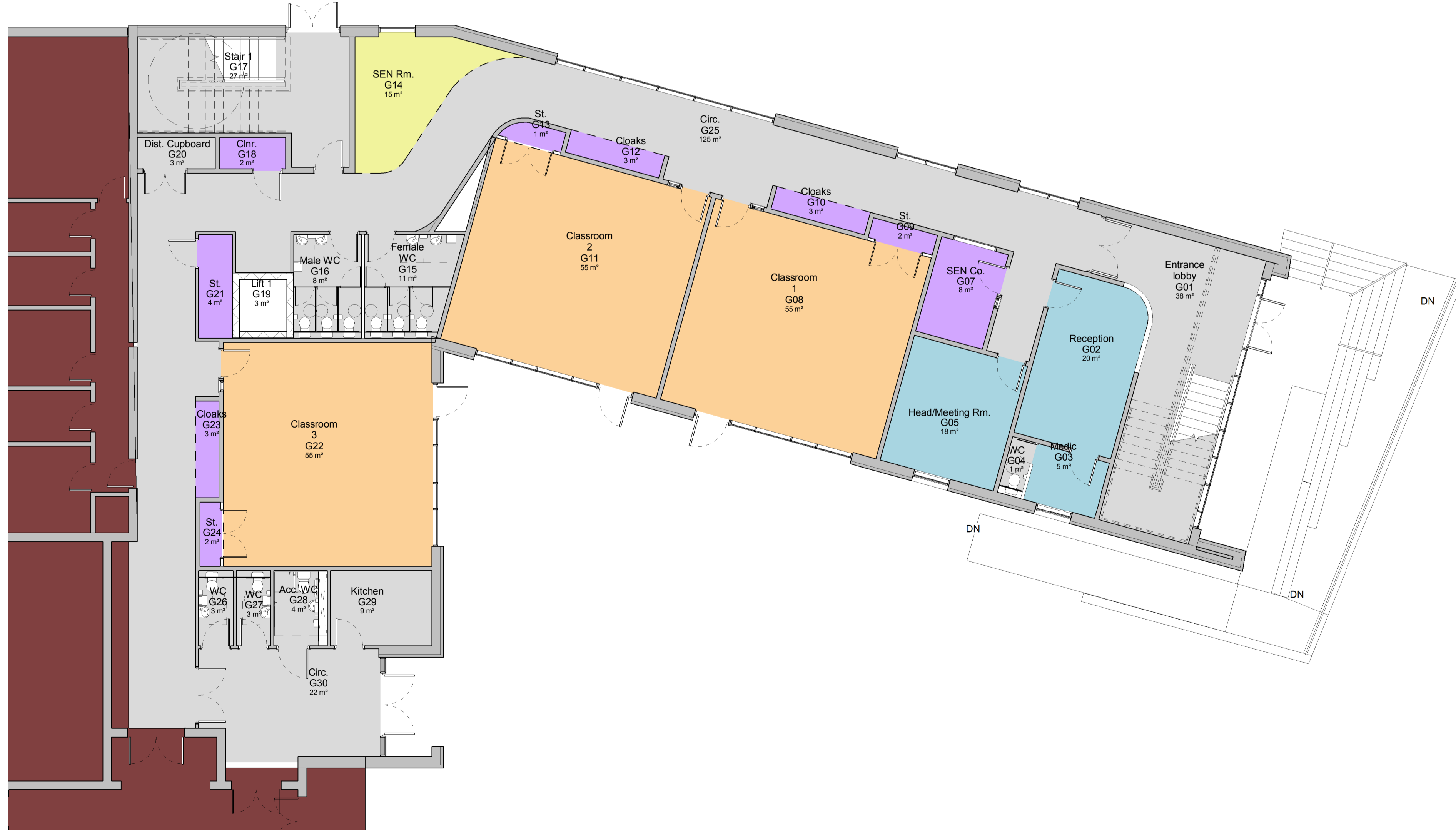
1 GA Floor Plan - Ground Floor 1 : 100