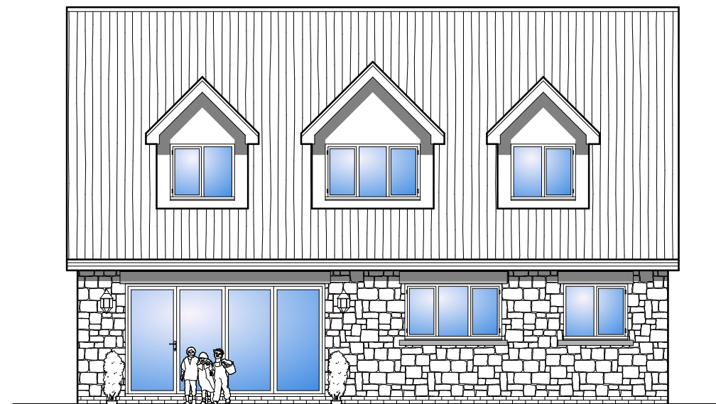
Rear Elevation as Proposed.