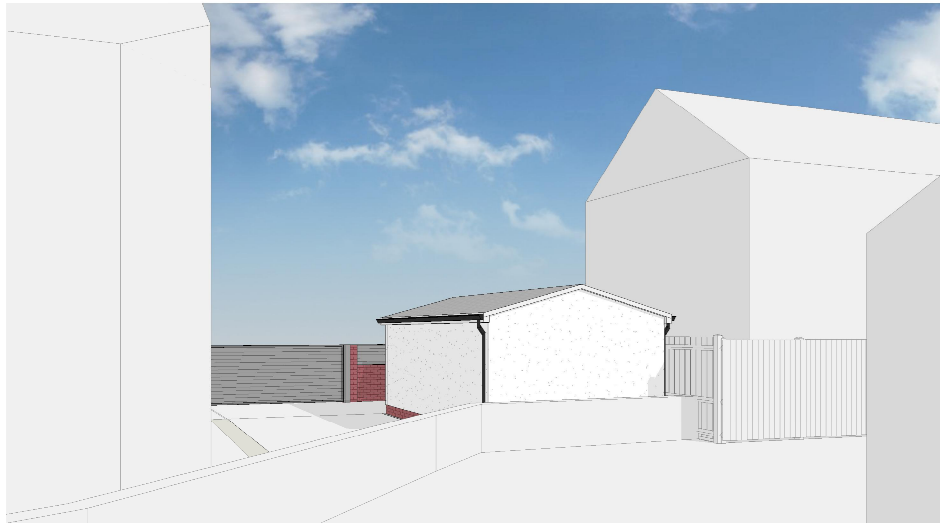
3D View 3