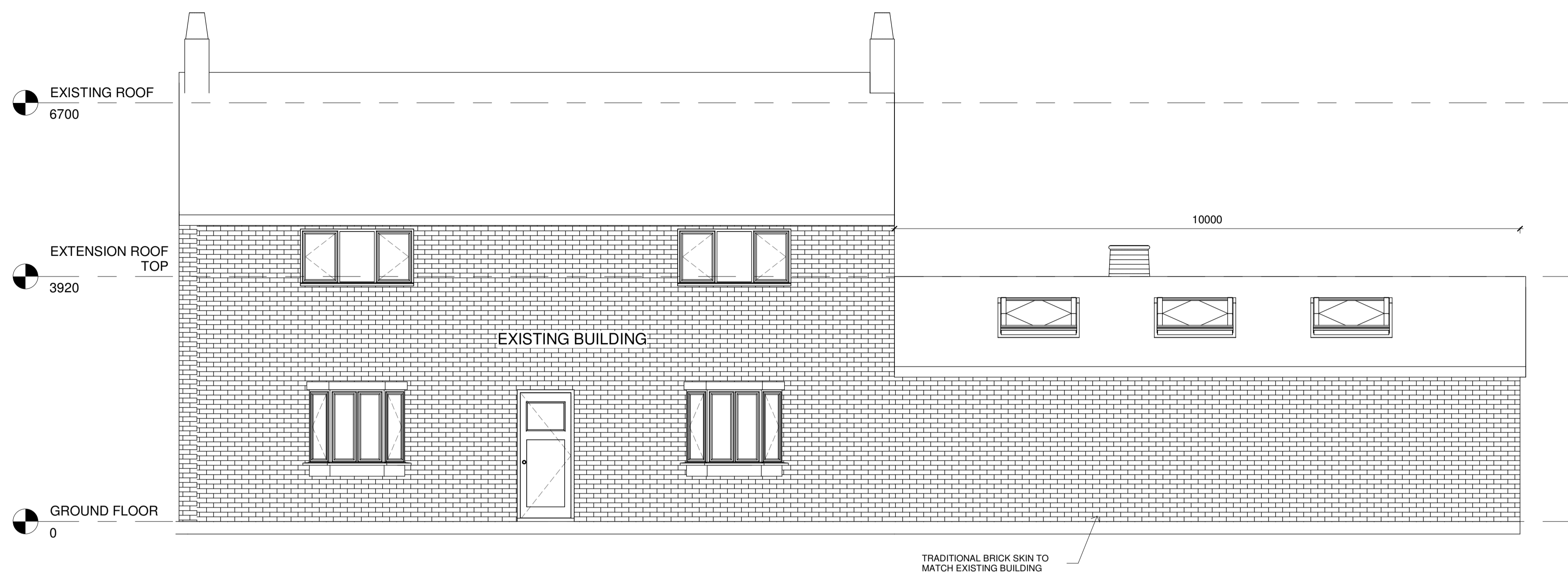
North Elevation 1 : 50