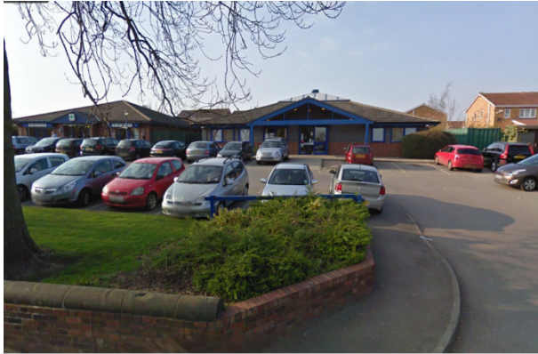
Royston Group Practice