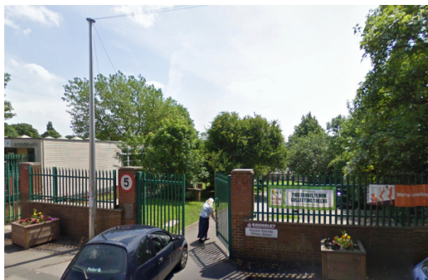
Parkside Primary School