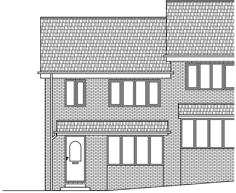
EXISTING FRONT ELEVATION SCALE 1:100 AT A3