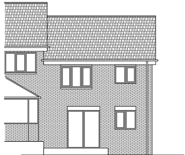
EXISTING REAR ELEVATION SCALE 1:100 AT A3