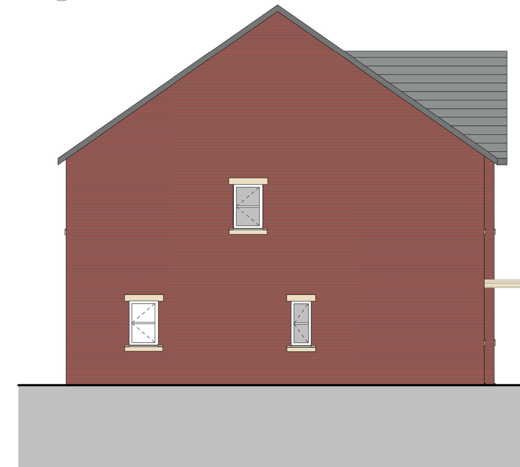
4 Side Elevation 02 1 : 50

RESPONSIBILITY IS NOT ACCEPTED FOR OTHERS SCALING DIRECTLY FROM THIS DRAWING. DO NOT SCALE FROM THIS DRAWING. USE WRITTEN DIMENSIONS ONLY.