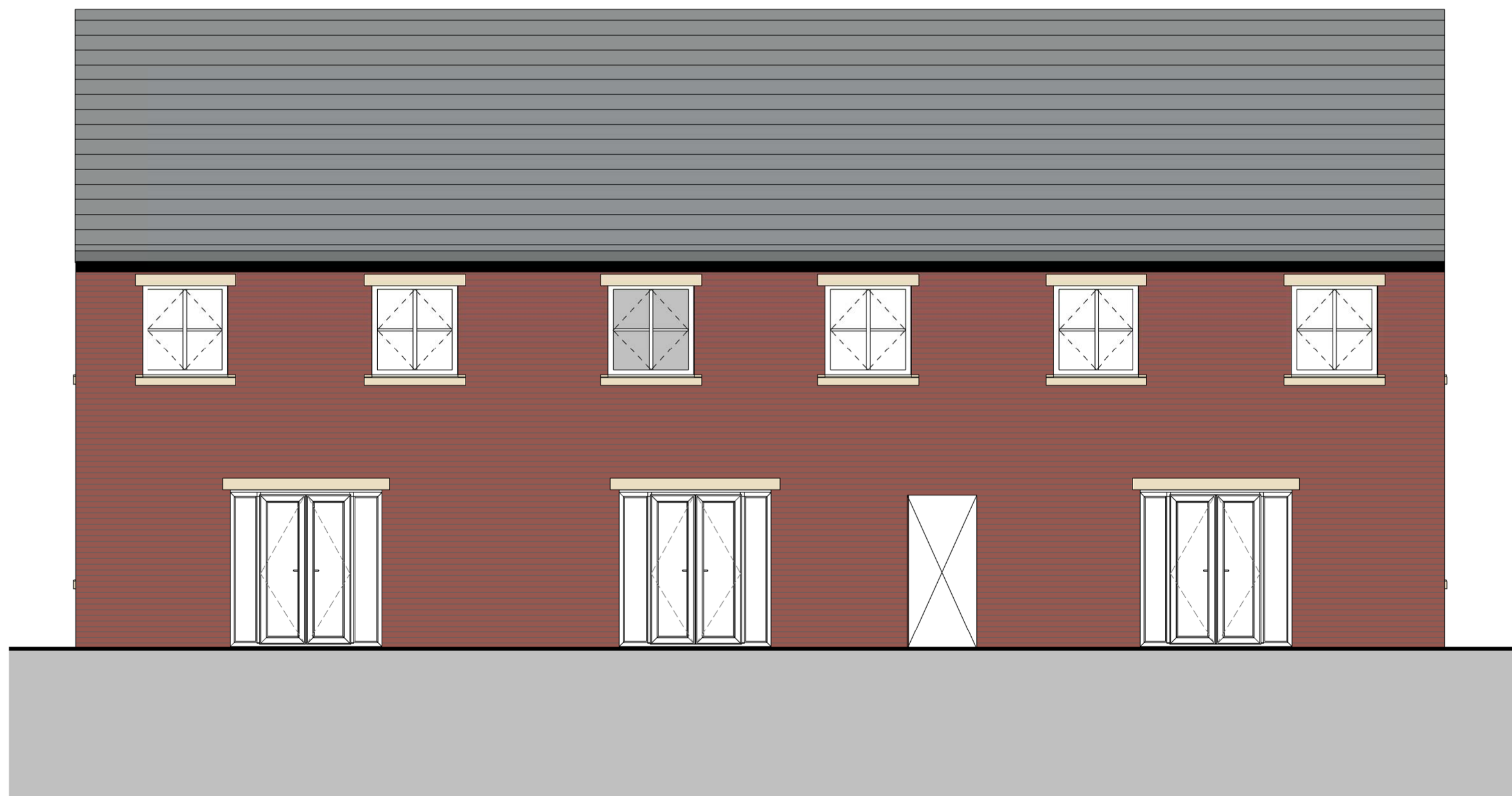
3 Rear Elevation 1 : 50