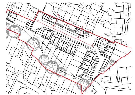
Key Section Plan