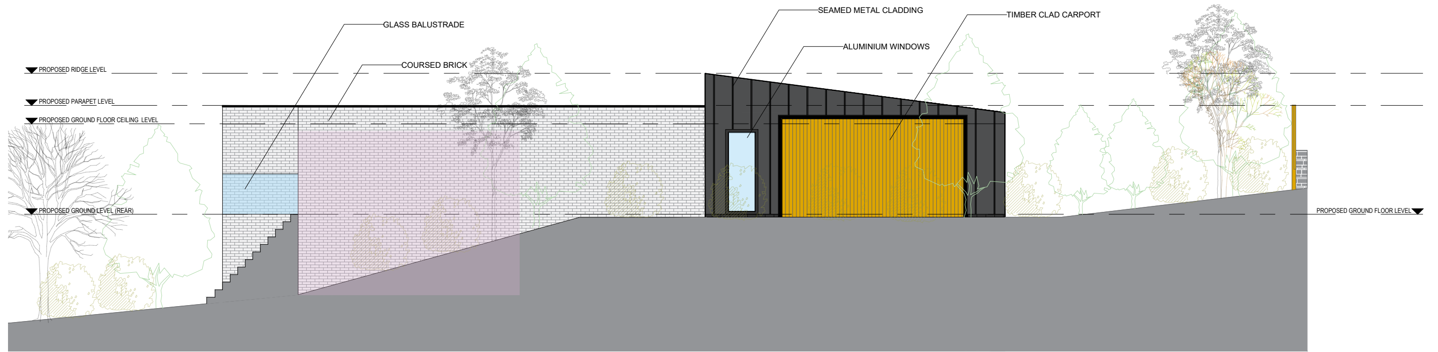
Proposed Left Elevation 1 : 100