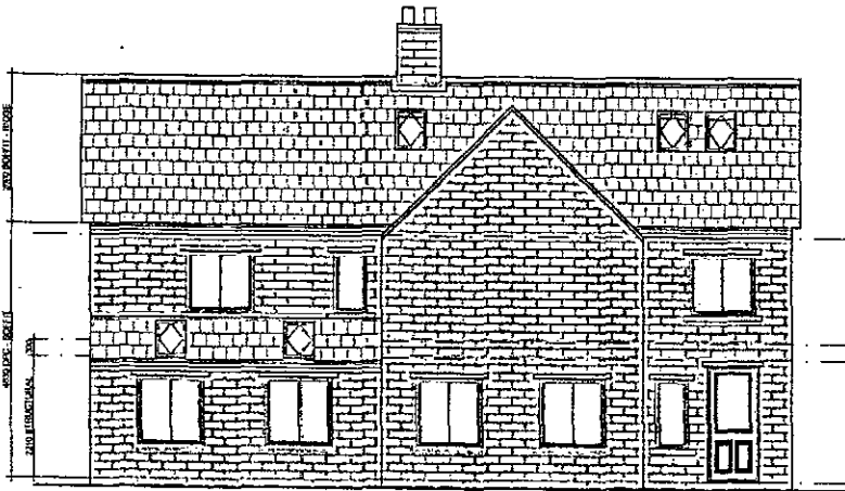
PROPOSED- REAR ELEVATION