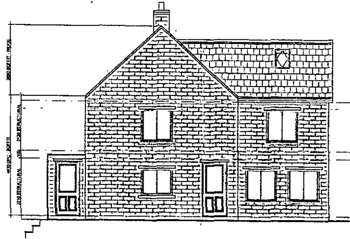
PROPOSED- RIGHT GABLE ELEVATION