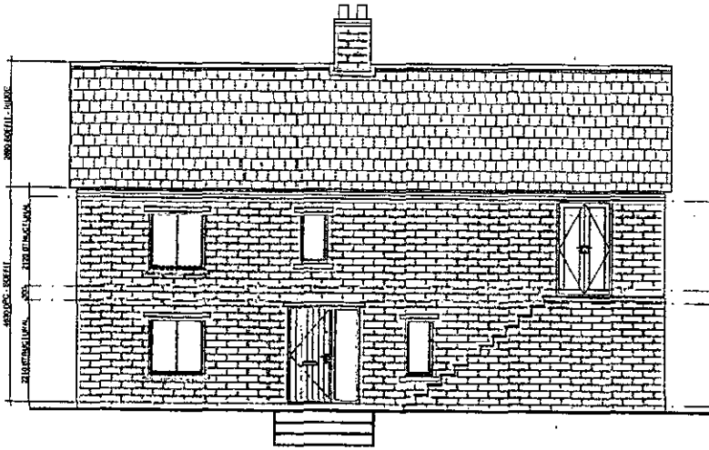
PROPOSED- FRONT ELEVATION