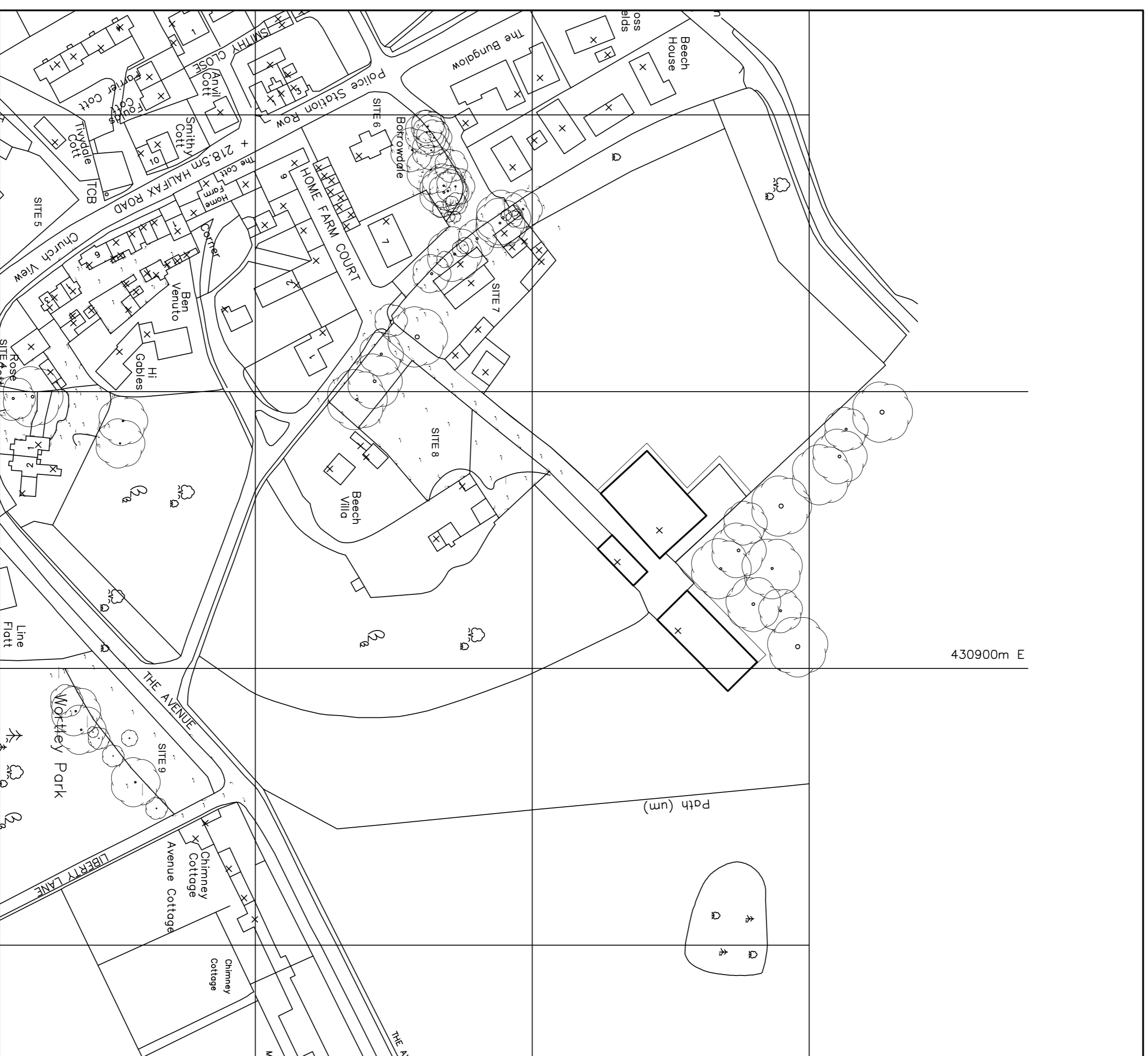
LAYOUT AS EXISTING 1:1250