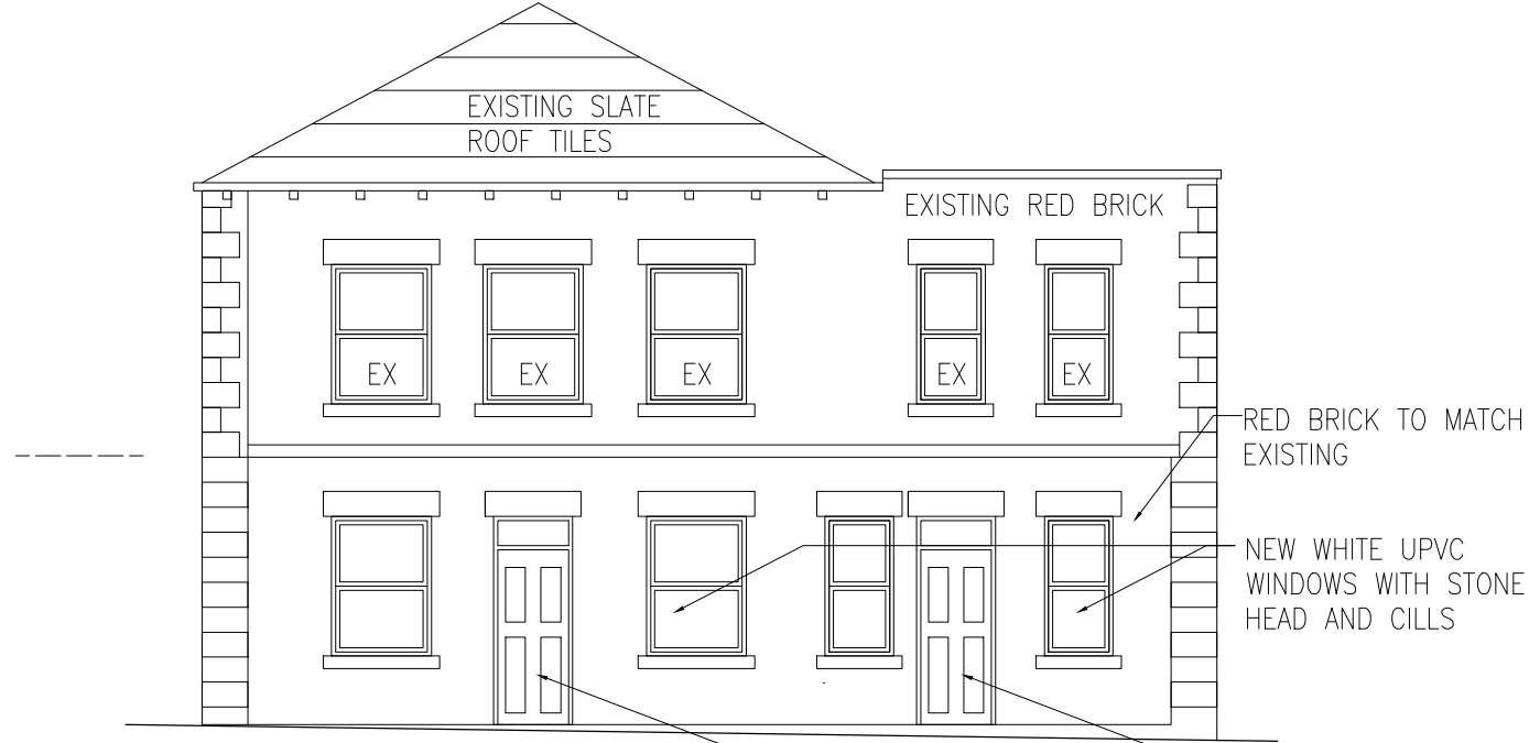
FRONT ELEVATION SCALE 1:100 @A3