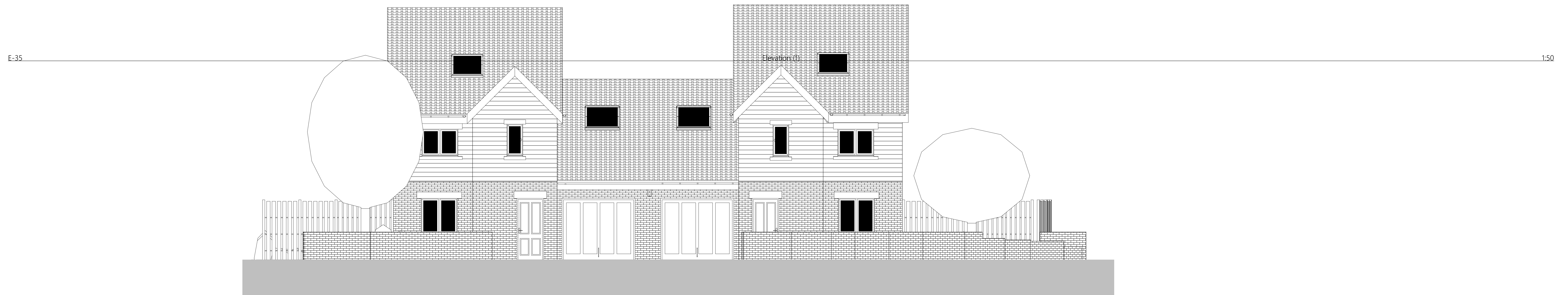
Front Elevation House Type 2 View from Back Lane West