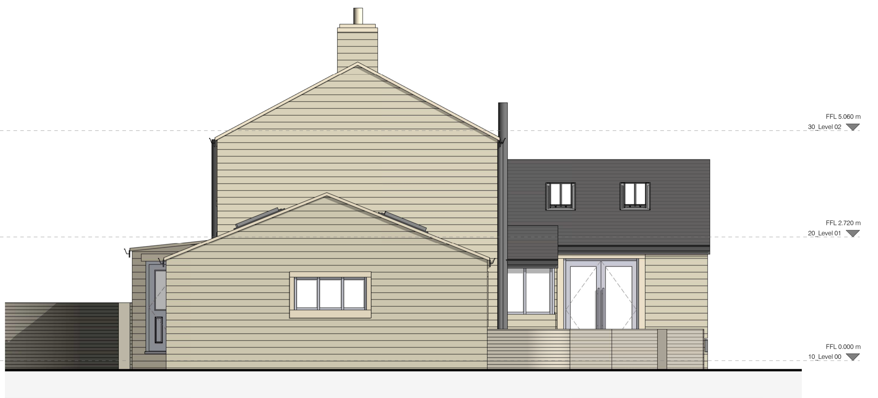
D - EXISTING SIDE ELEVATION 02 1 : 50