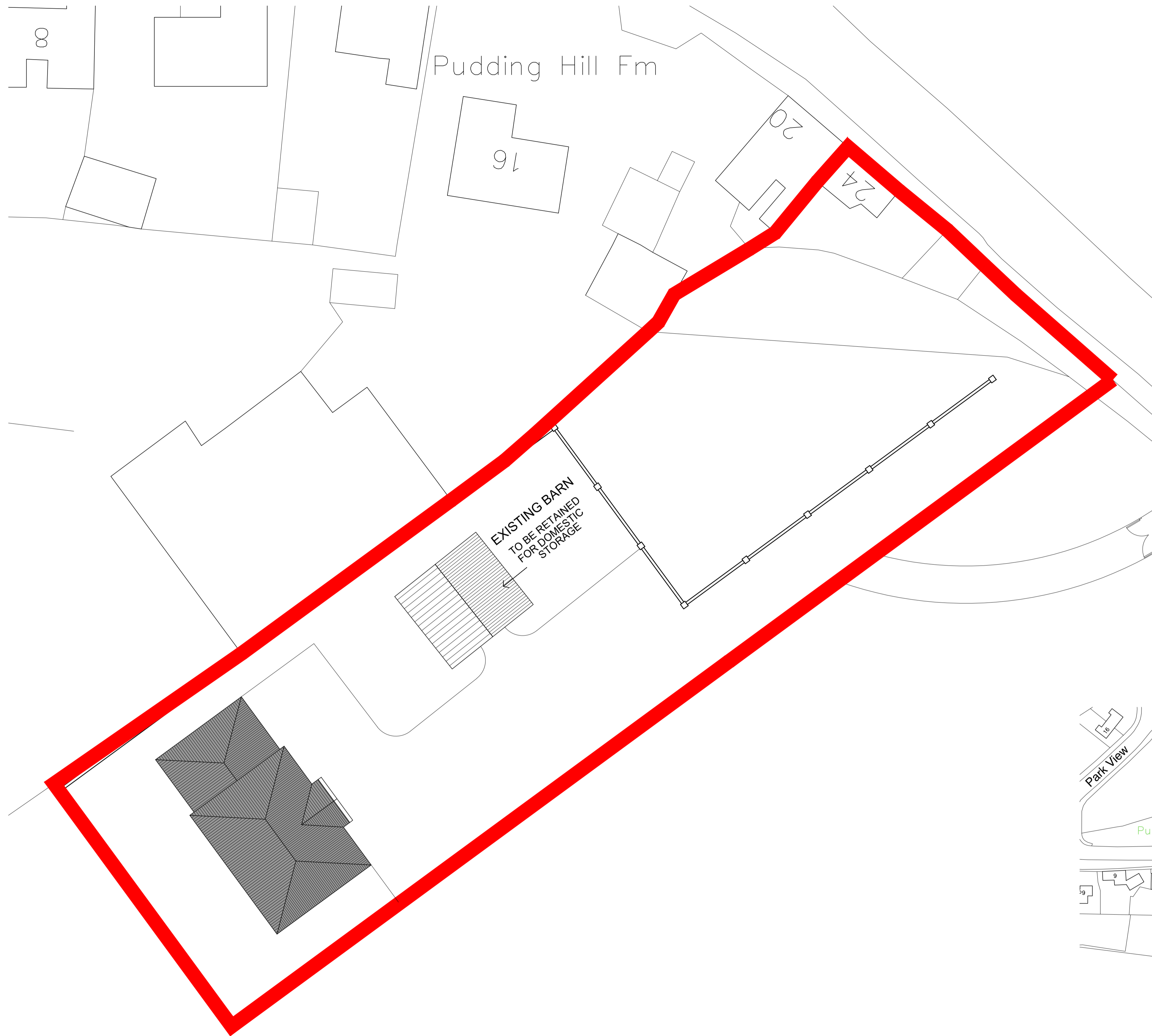
PROPOSED SITE PLAN SCALE 1:250