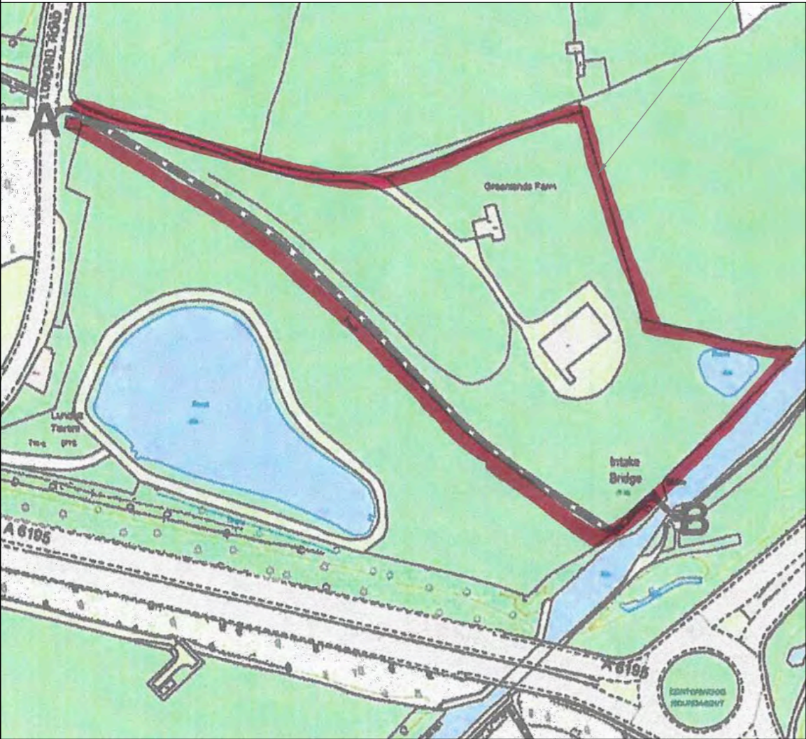
LOCATION PLAN SCALE 1:2500 AT A3