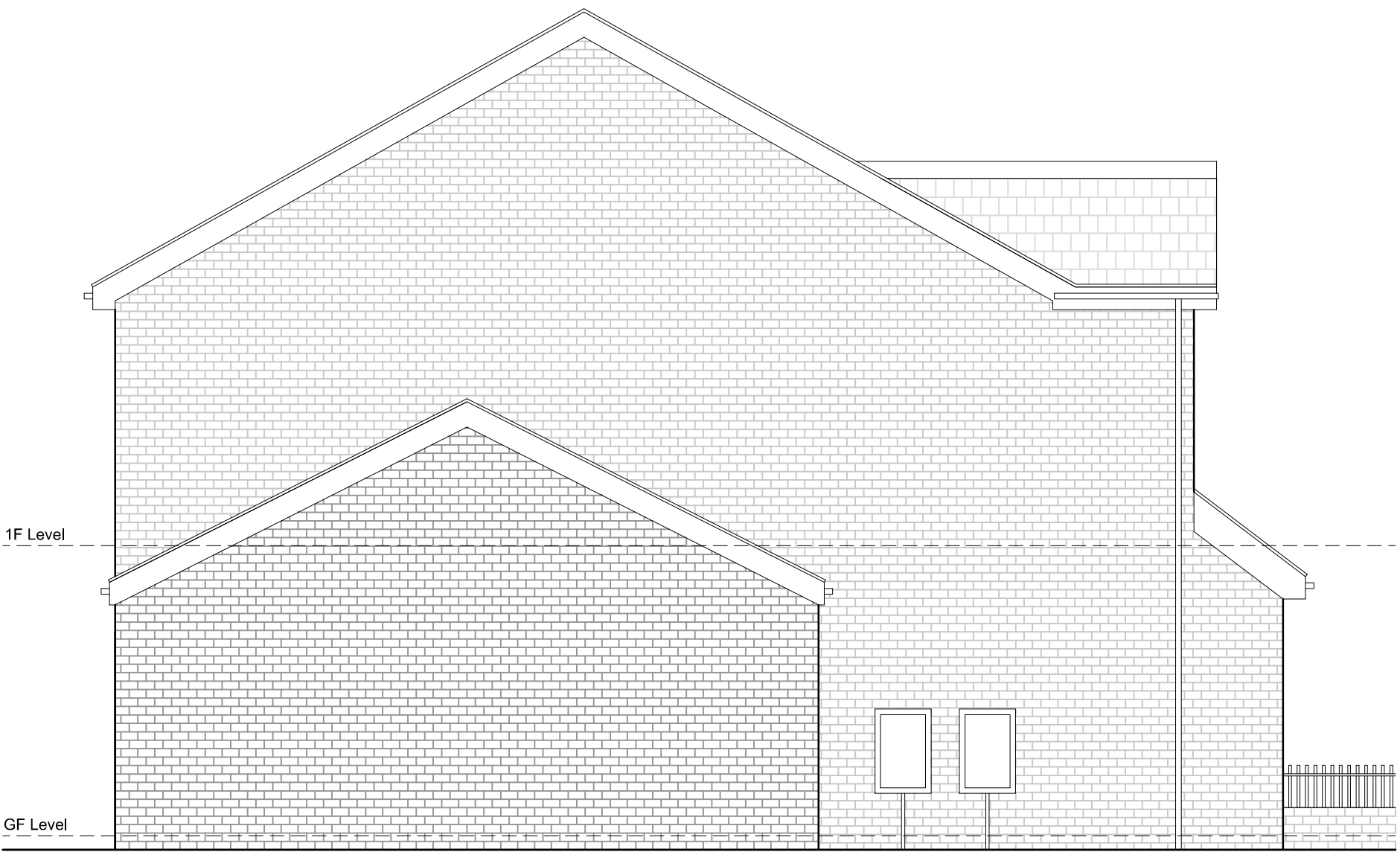
Existing West Elevation Scale: 1:50