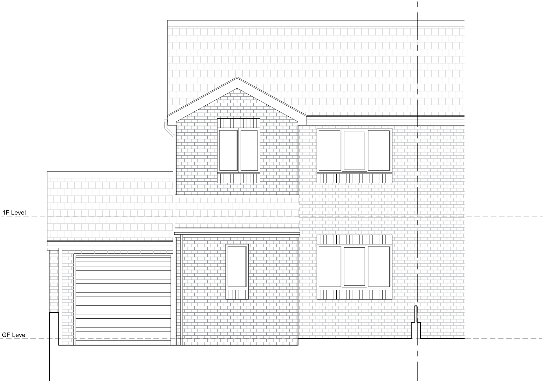
Existing North Elevation Scale: 1:50