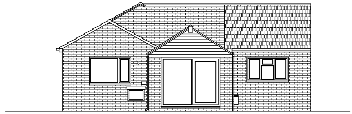
EXISTING REAR ELEVATION SCALE 1:100 AT A3