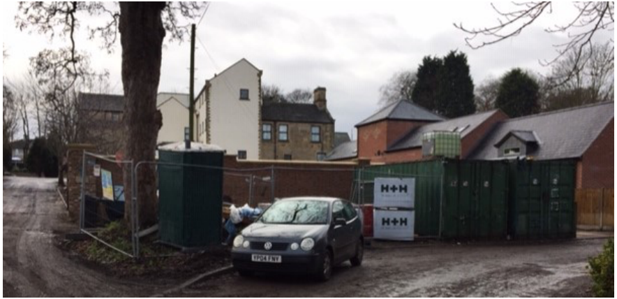
This shows the drive to Thurnscoe Hall on the left, the new boundary wall and the entrance to where the cabin will be sited which is the far side of the green cabins. The green cabins and building materials will eventually be removed and used for visitor parking.