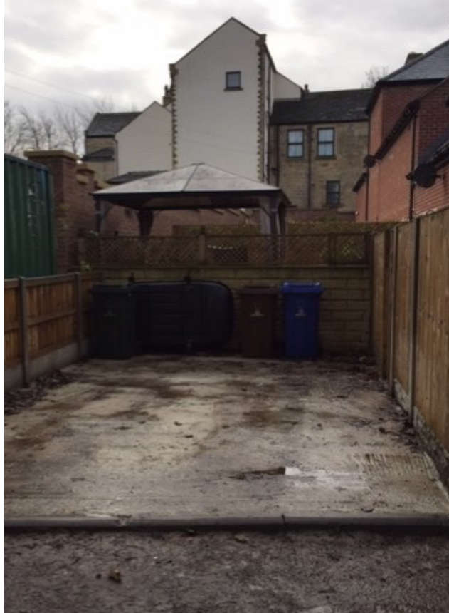
This shows the area where the proposed cabin will be sited. Thurnscoe Hall is at the end and the back gardens to Thurnscoe Hall Mews are between the two with the boundary wall to Thurnscoe Hall running along the left hand side of this picture.