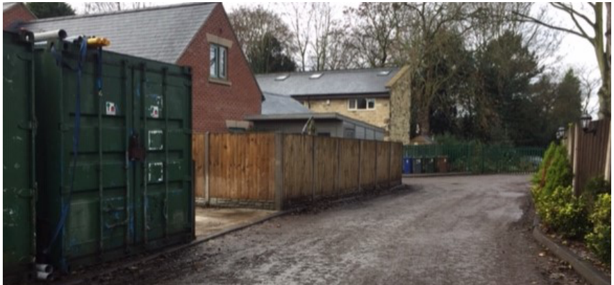
The entrance to the site of the proposed cabin for grooming is on the left between the green cabins and the fencing.