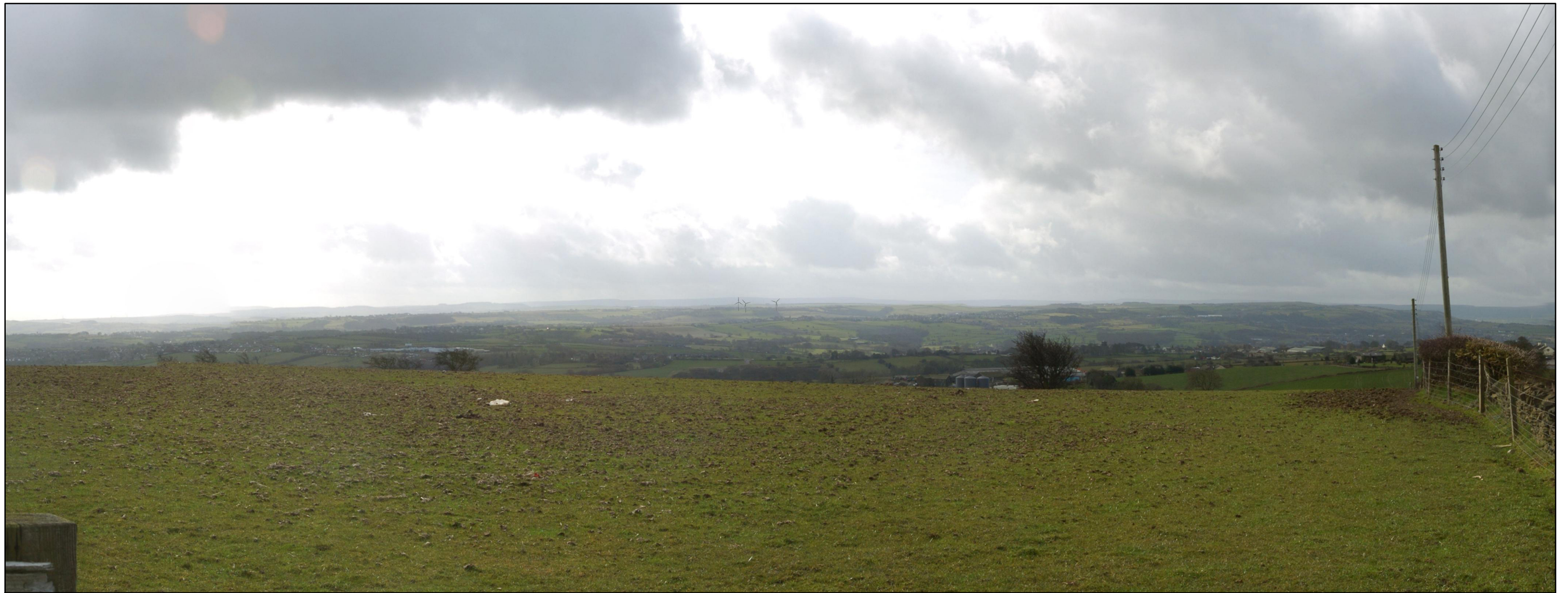
Photomontage showing proposed development from viewpoint