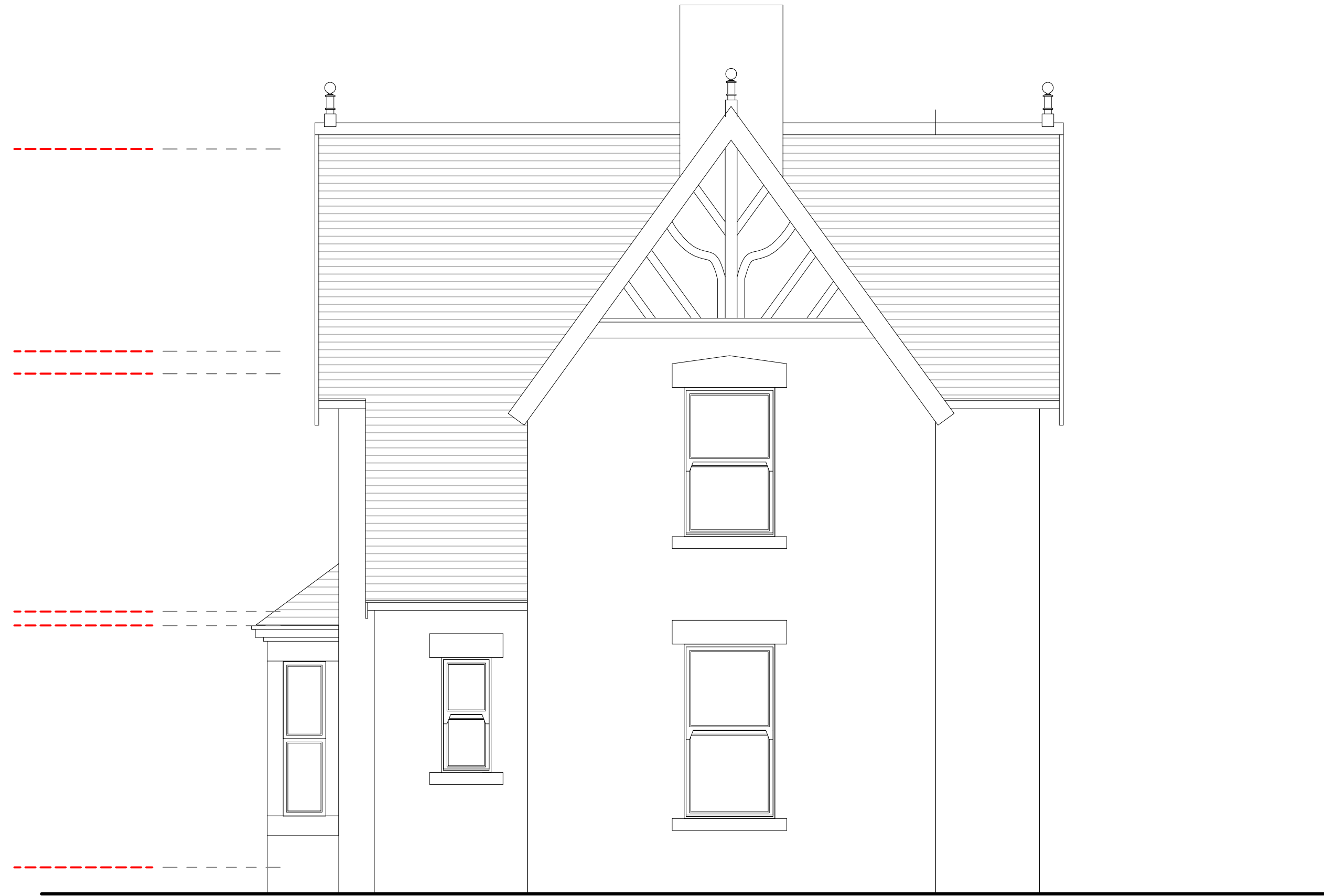
EXISTING SIDE ELEVATION (FACING DRIVE)