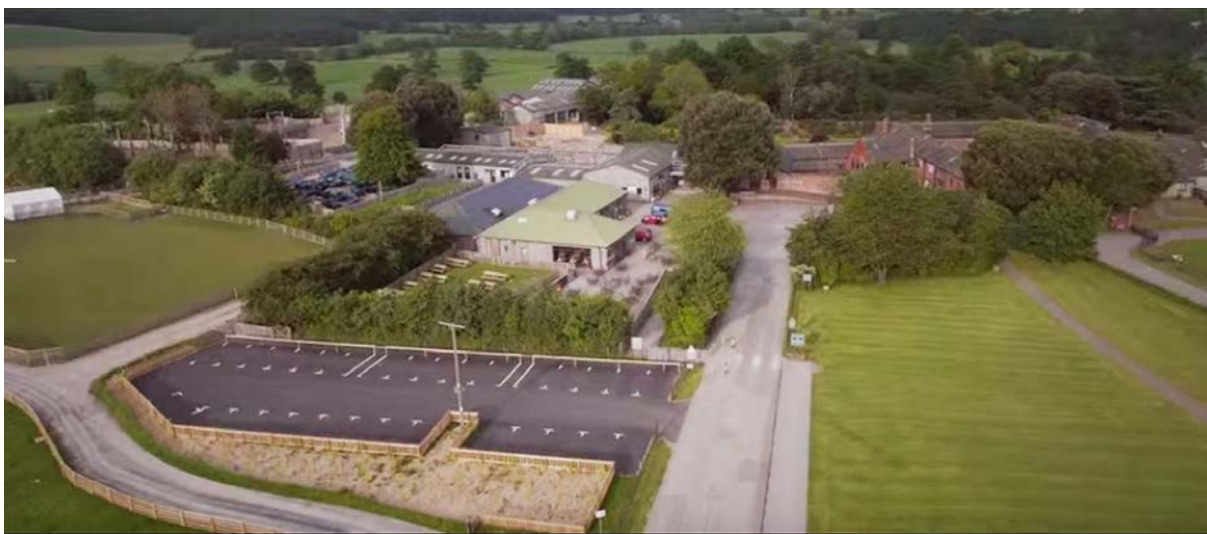
General site view showing premises setting in relation to the Museum