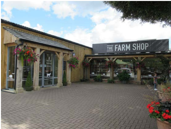
Typical Farm architectural style and low rise profiles