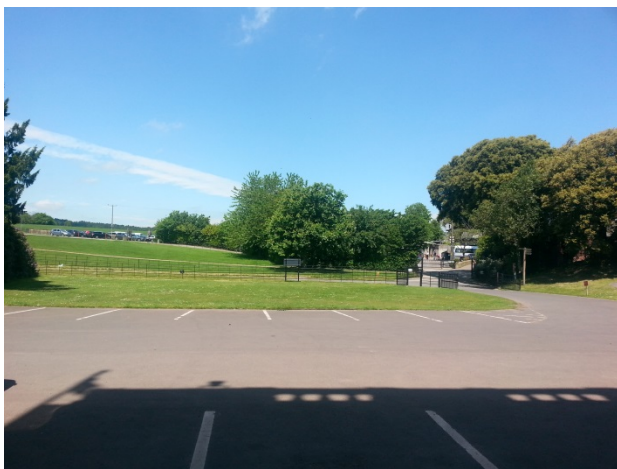
Principal view from Museum Main Entrance towards the Farm