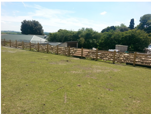
General scale of Farm Building roofs below the existing tree lines