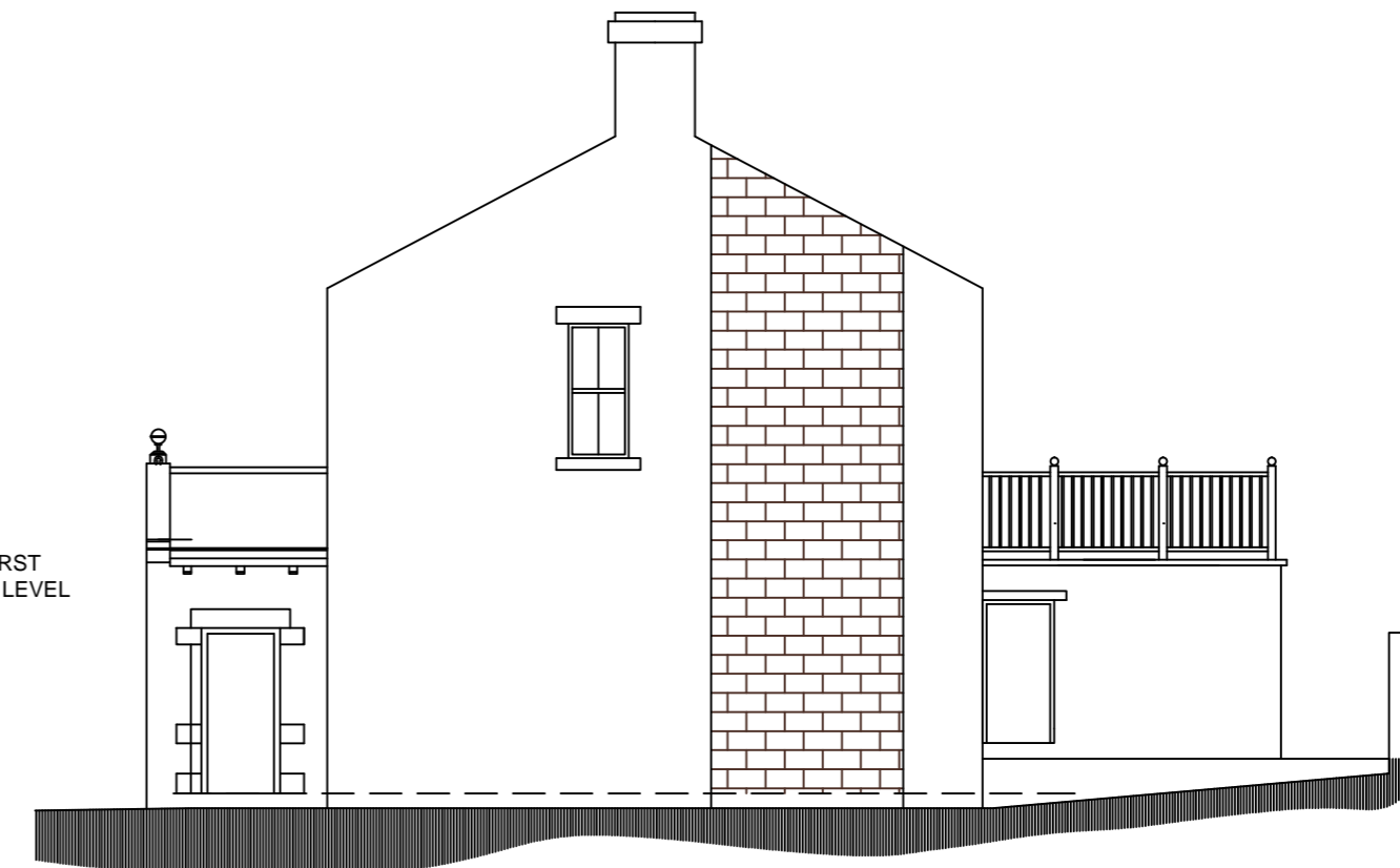
SIDE ELEVATION AS PROPOSED