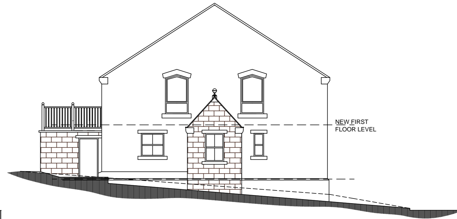
SIDE ELEVATION AS PROPOSED