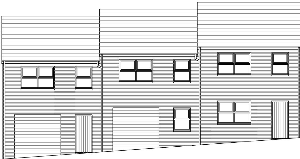
WEST ELEVATION – TO POND STREET