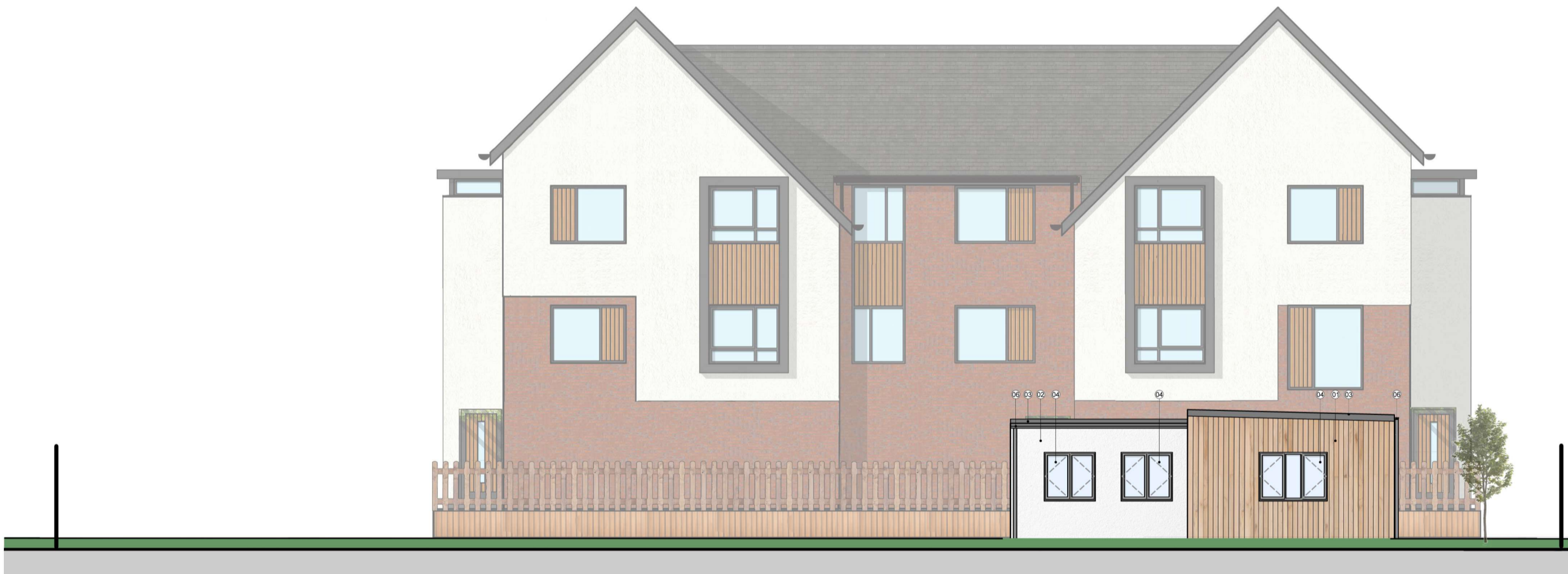
Proposed Site Elevation - E2 SCALE 1:100