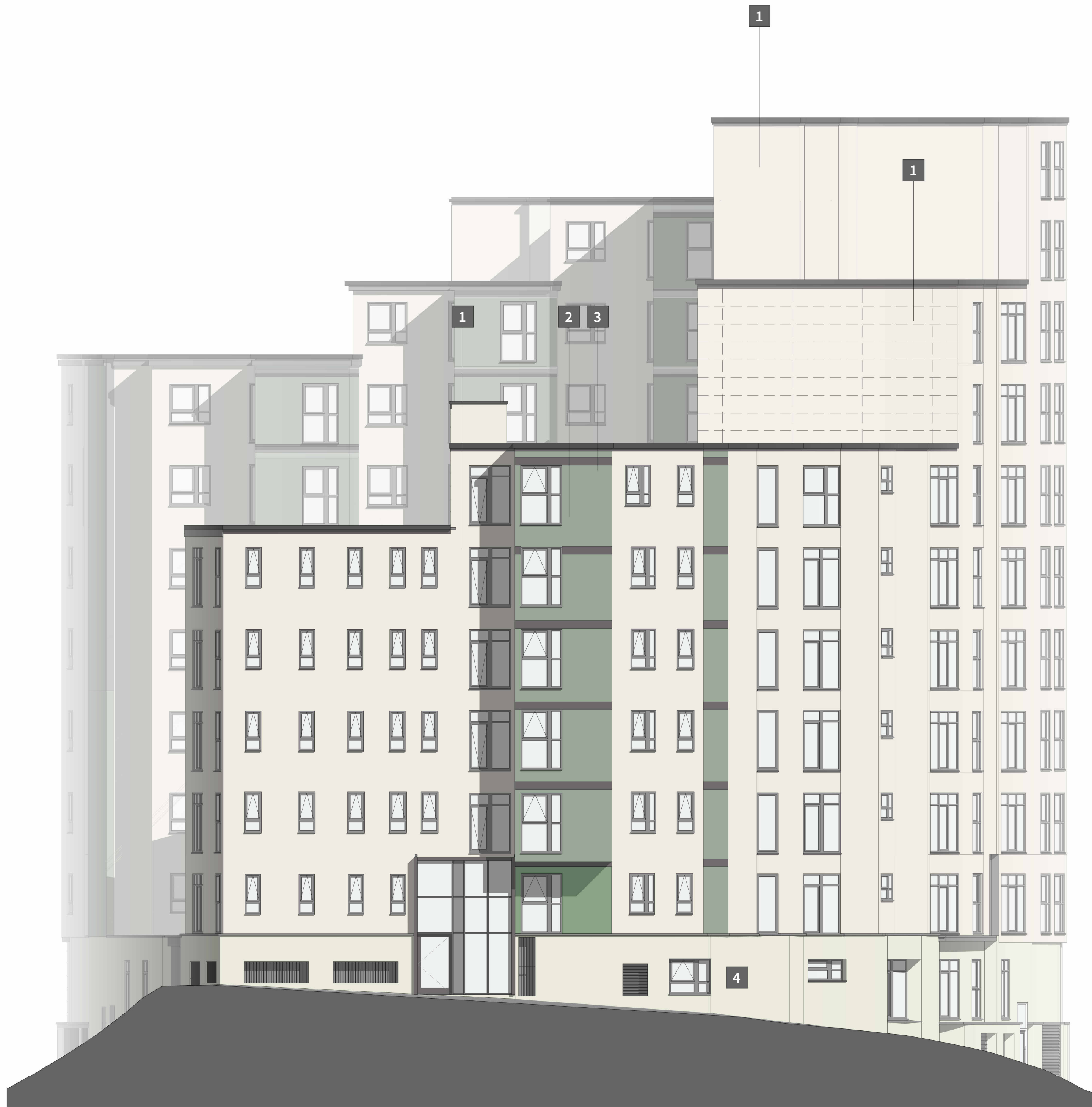
1 Existing Elevation - Heelis street-02 1 : 100