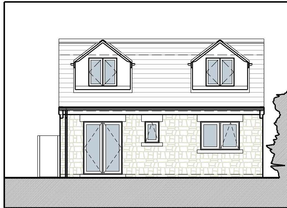
North Elevation - Proposed No1,2,3,4