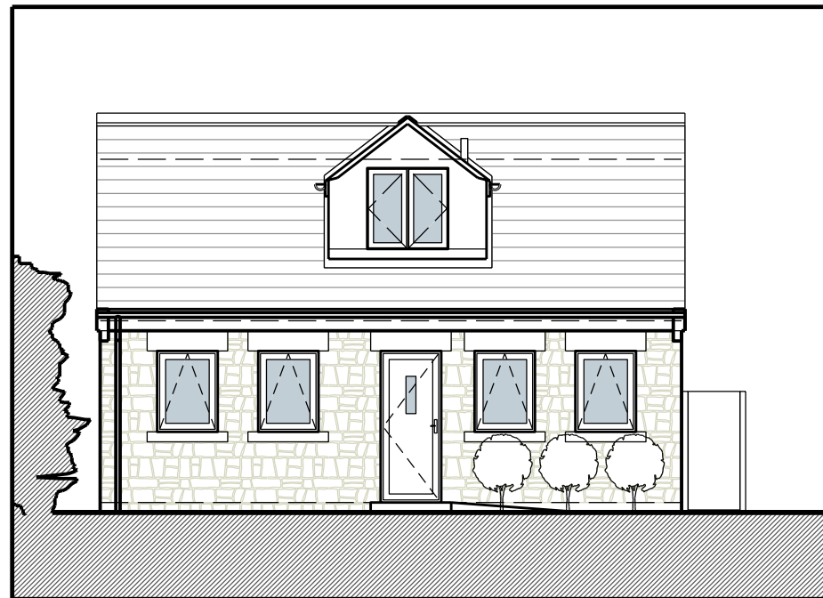
South Elevation - Proposed No1,2,3,4