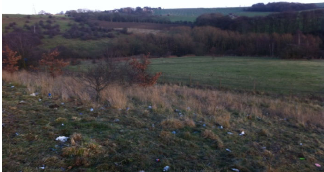
Photo 11 Looking north from the northern boundary of the site. View on to Tom Bank Wood.