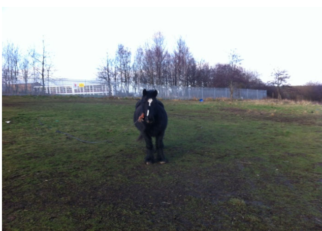
Photo 10 Looking from the south if the site from the public open space.