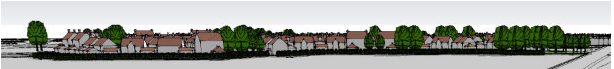
Distant view form the north indicating the landscape buffer