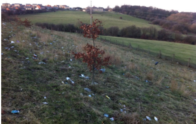
Photo 13 Looking north from the northern boundary of the site towards Brierley.