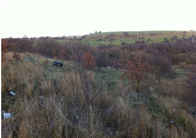
Photo 12 Looking north from the northern boundary of the site towards Brierley. Indicating the valley to Tom Bank Wood