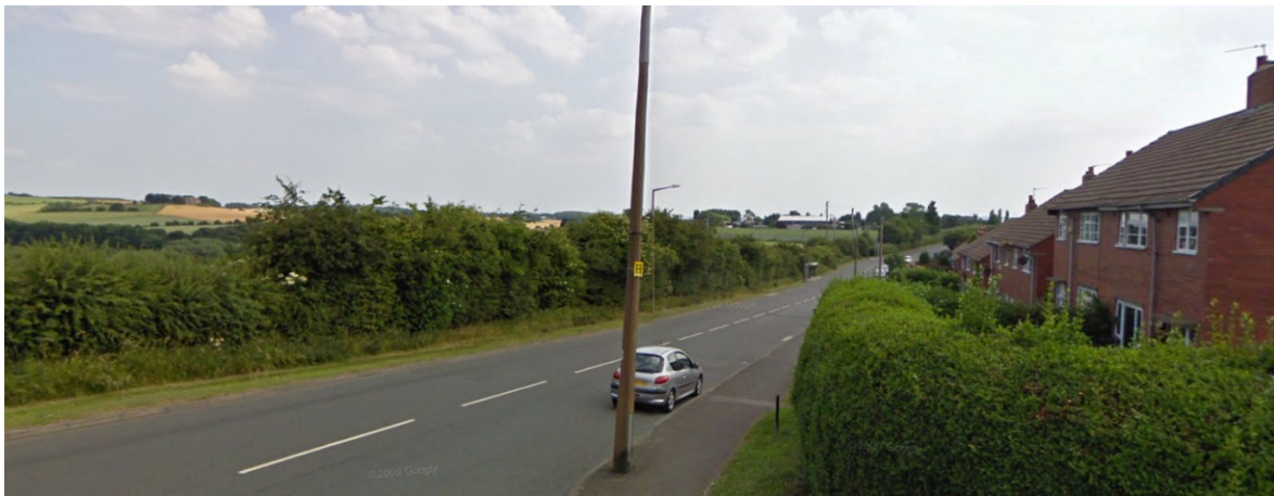
Photo 15 Looking from Brierley towards the proposed development—closer than 14. The previous school buildings can be seen. The proposal have a lesser impact due to the scale and the mitigation of the landscape buffer and use of existing levels.