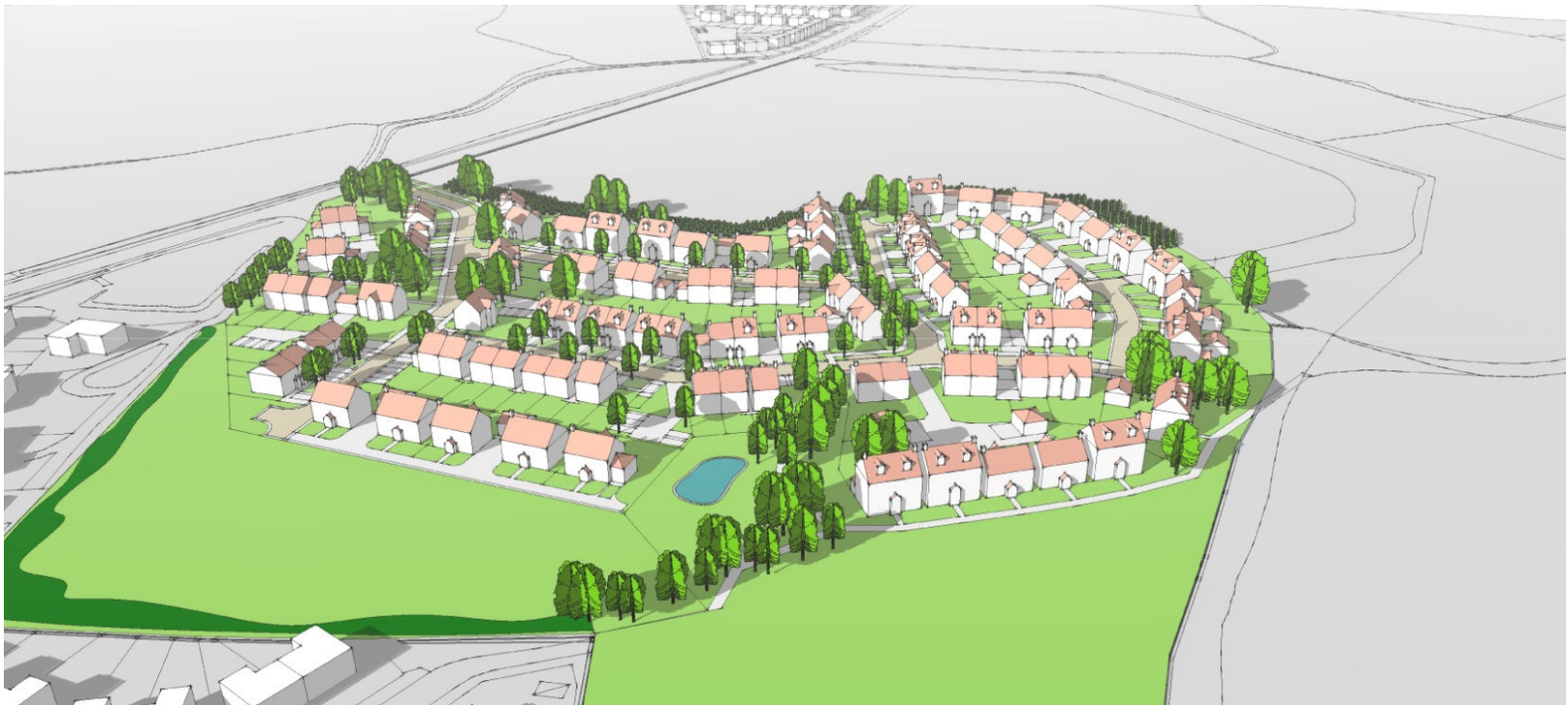
View from the south showing the proposed green link to Grimethorpe across the site to the open land to the north