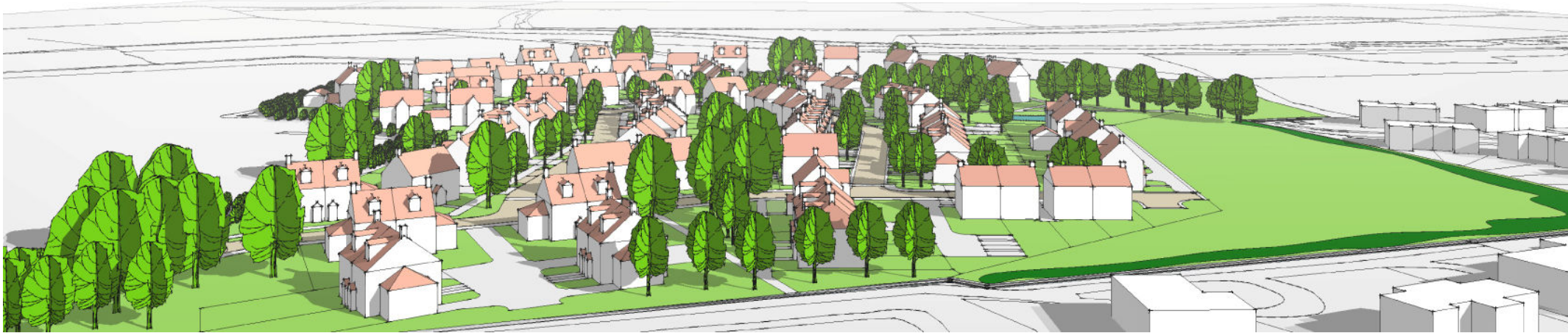
View from the west showing courts, streets and the open land to the south