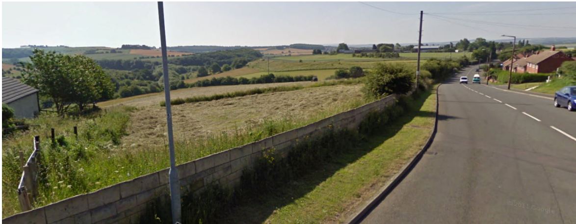
Photo 14 Looking from Brierley towards the proposed development. The landscape buffer and drop in level will reduce the development impact and soften the boundary to the green belt.