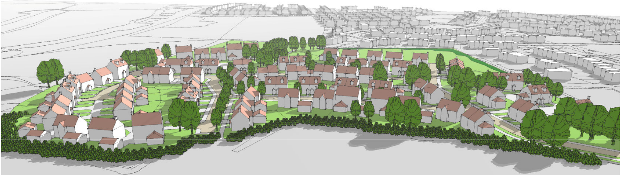
View from the north indicating the landscape buffer