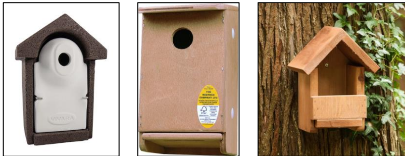
Figure 2: Vivara Pro Seville Nest Box, House Sparrow Nest Box and Apex Robin Box

All nest boxes should be positioned at least 3m above ground level where they will be sheltered from prevailing wind, rain and strong sunlight. Small-hole boxes are best placed approximately 1-3m above ground on an area of the tree trunk where foliage will not obscure the entrance hole. See figure 2 below for pictures of the bird boxes and Appendix 3 for suggested placement. These should be installed on site upon completion of the proposed works.