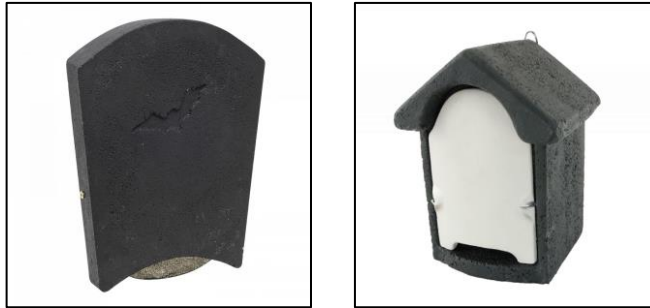
Figure 1: Beaumaris Woodstone Bat Box and Vivara Pro WoodStone Bat Box

Bat boxes should be erected on a mature retained tree on site, between 3-5m above ground level, in a shady location facing south/south-westerly directions with clear flight paths to and from the entrance. They will be placed on different elevations of the same tree to allow bats to move from one box to another to maintain suitable microclimatic roost conditions throughout the day. See figure 1 below for pictures of the bat boxes and Appendix 3 for suggested placement. These should be installed on site upon completion of the proposed works.