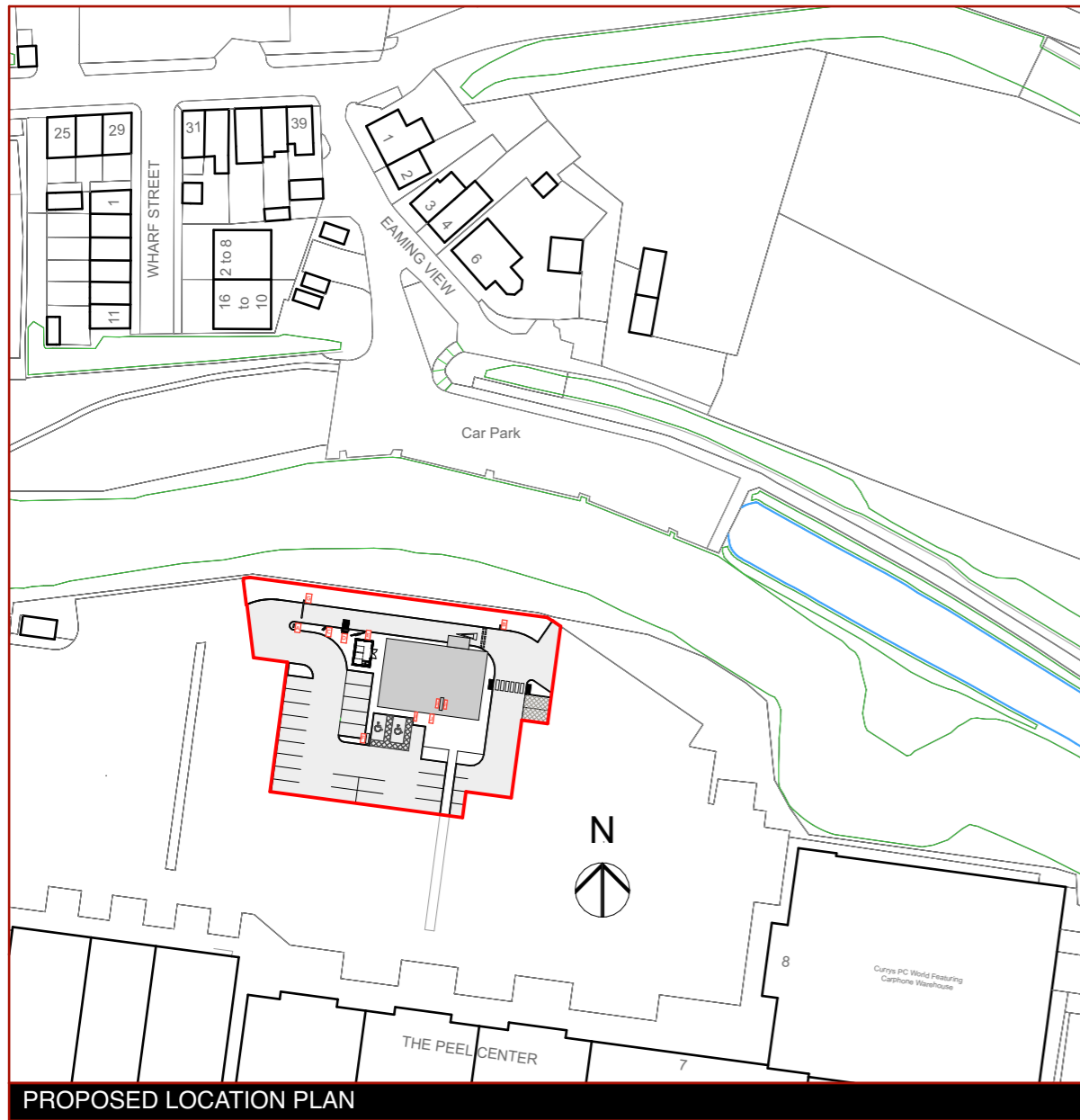
PROPOSED LOCATION PLAN

© Crown Copyright and database rights 2021 OS 100047474.